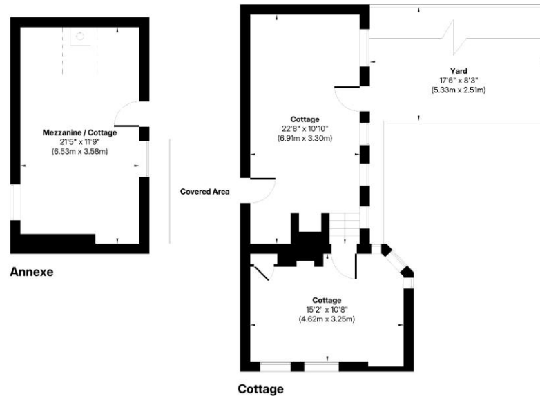
Illustration for identification purpose only, measurements approximate and not to scale.