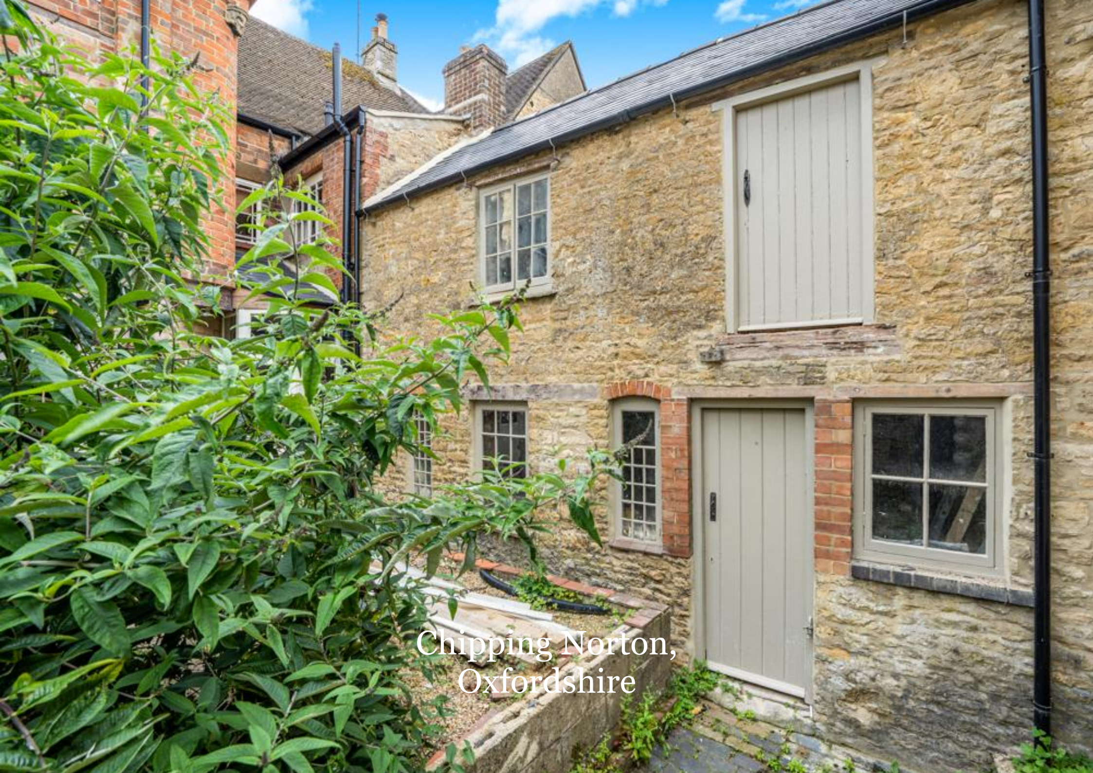
Chipping Norton, Oxfordshire