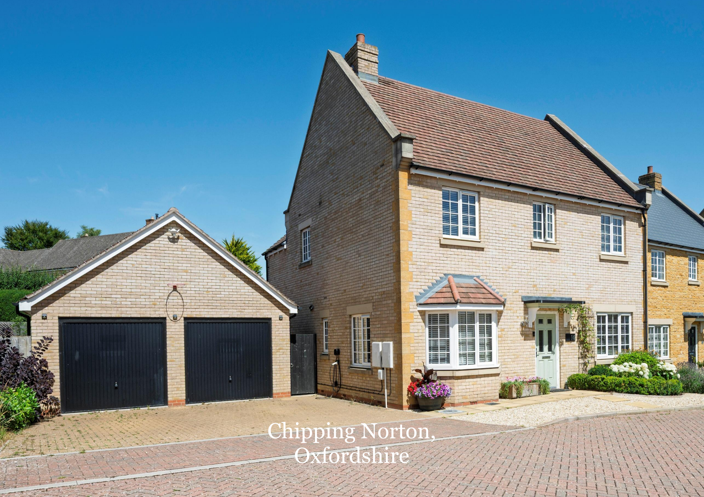
Chipping Norton, Oxfordshire