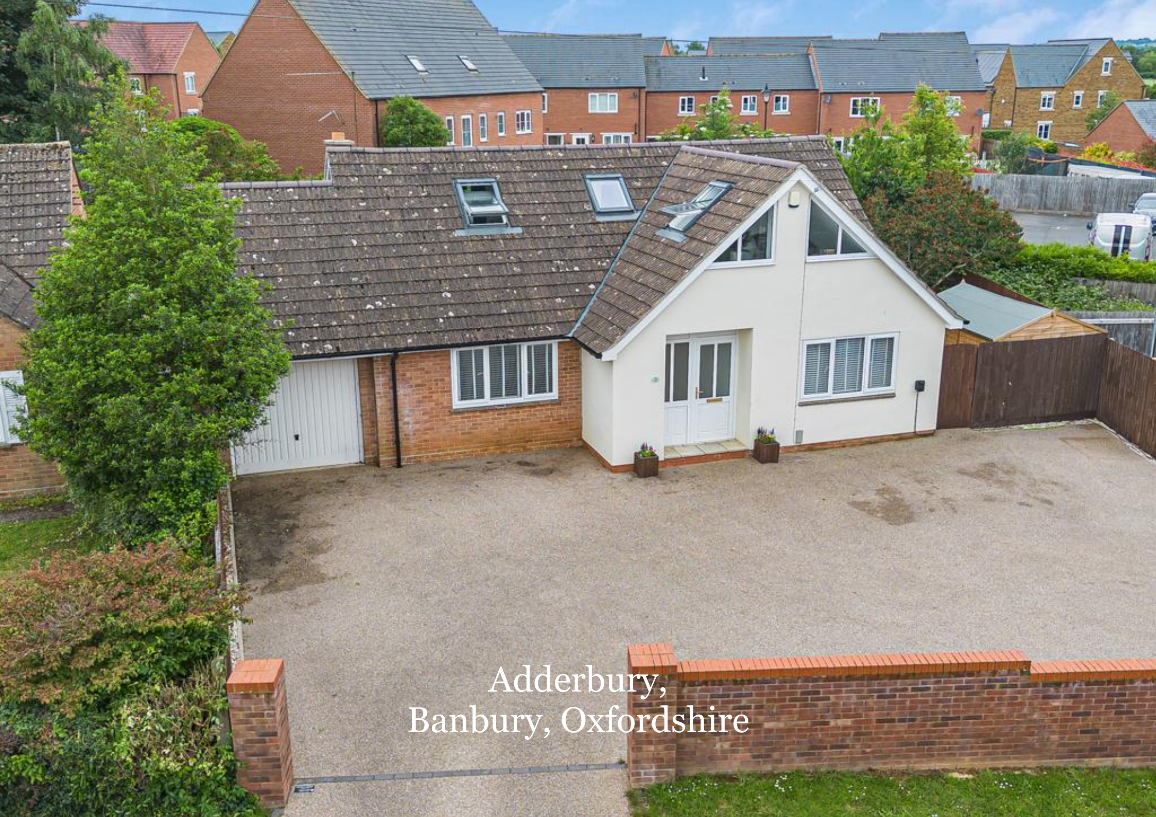
Adderbury, Banbury, Oxfordshire