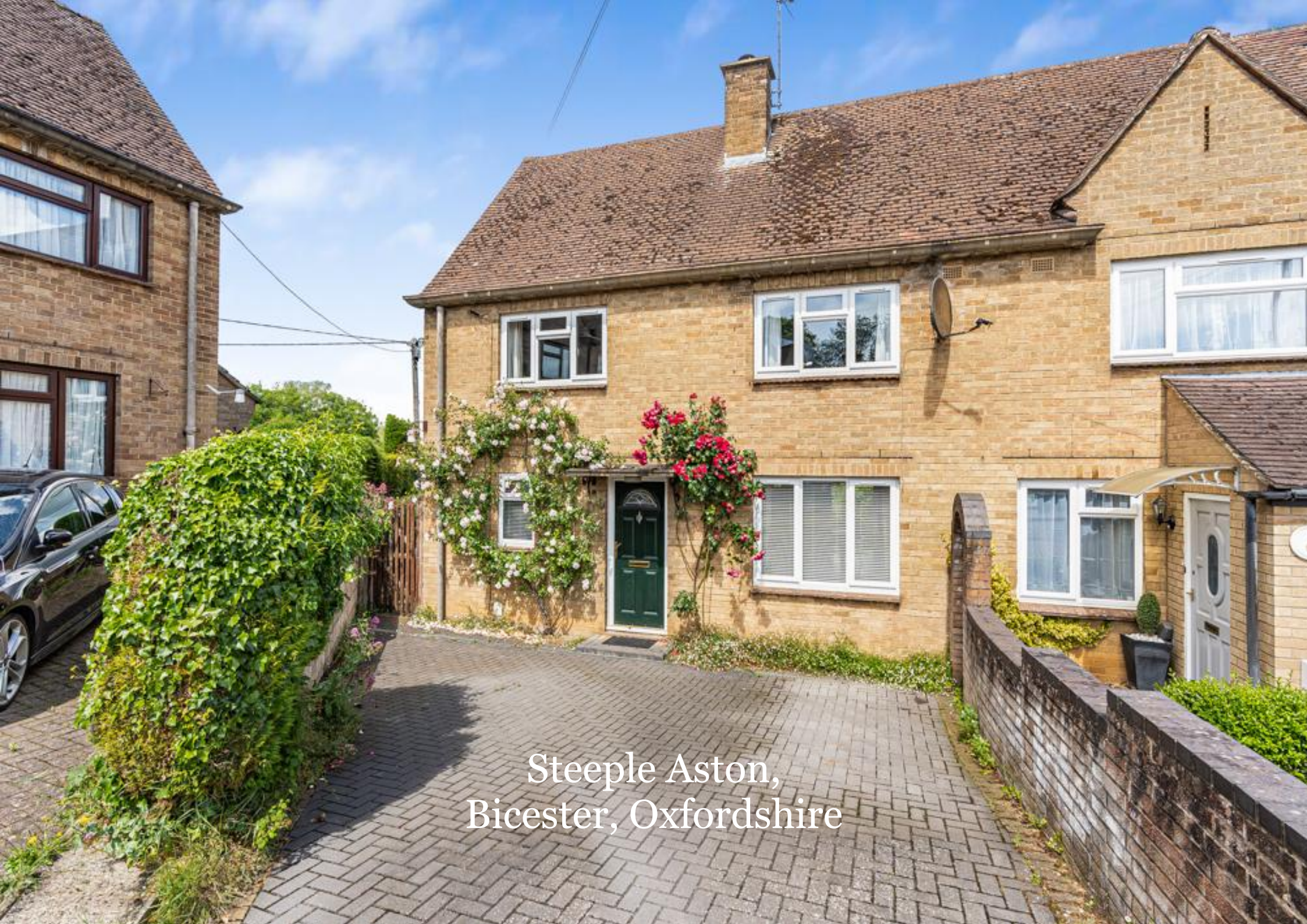
Steeple Aston, Bicester, Oxfordshire