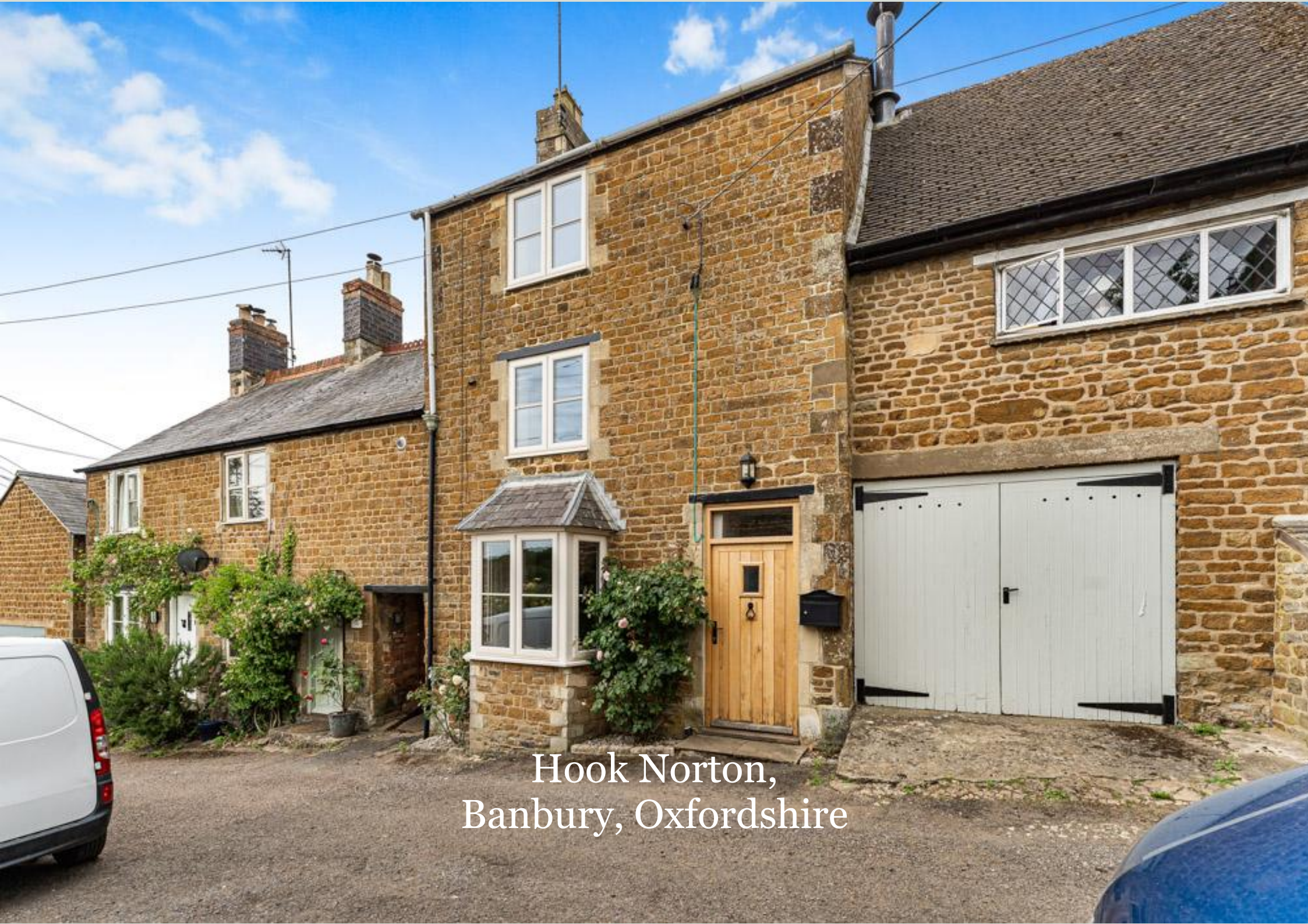
Hook Norton, Banbury, Oxfordshire