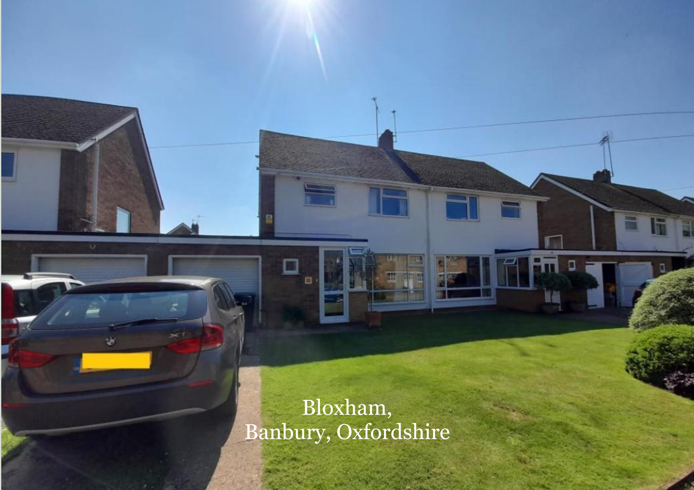
Bloxham, Banbury, Oxfordshire