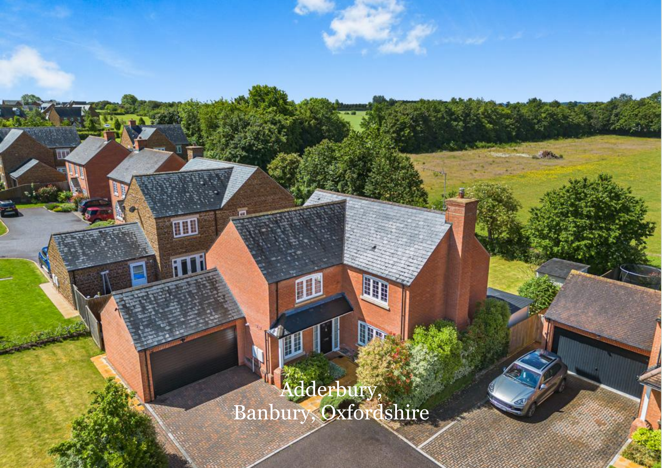
Adderbury, Banbury, Oxfordshire