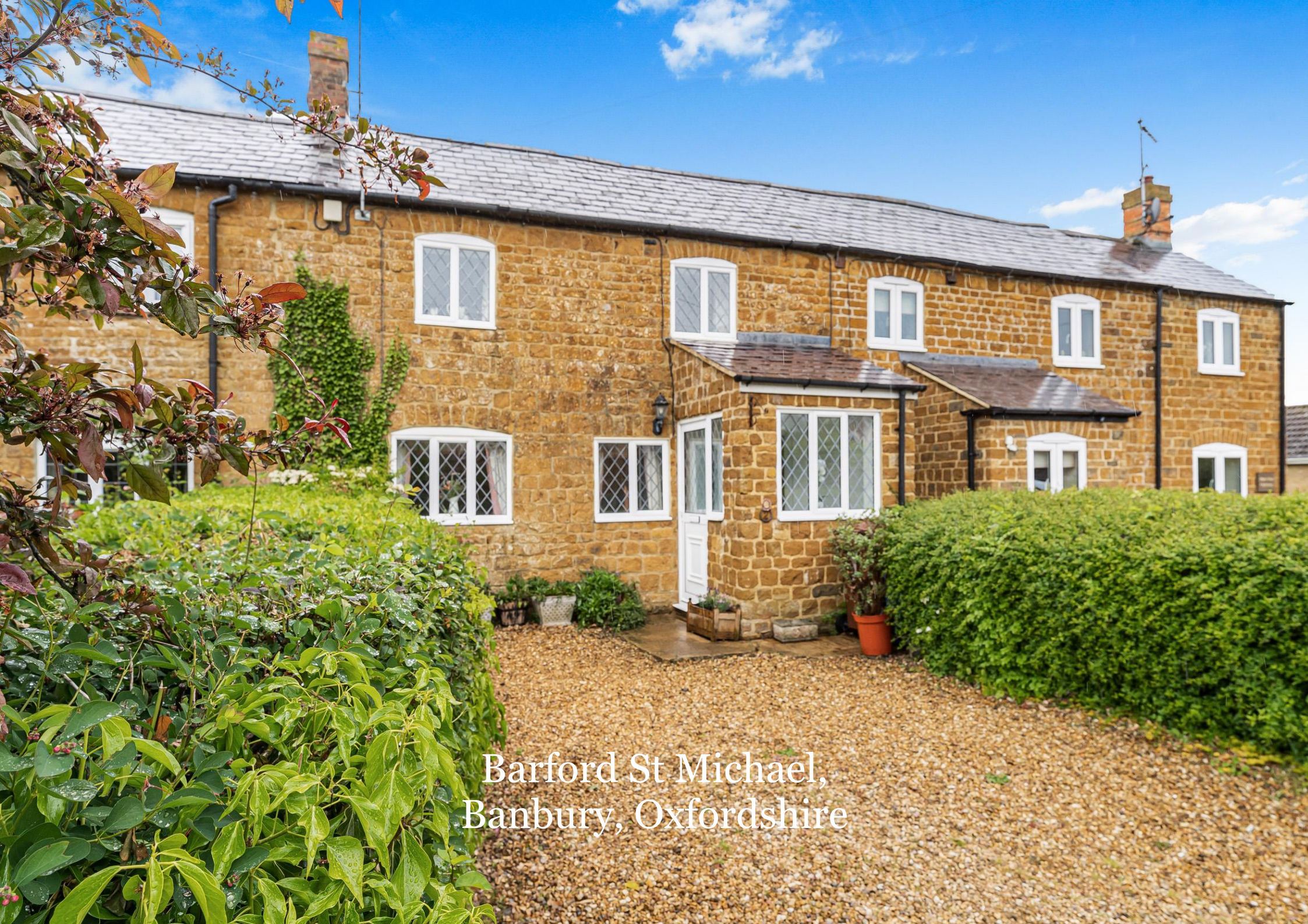
Barford St Michael, Banbury, Oxfordshire