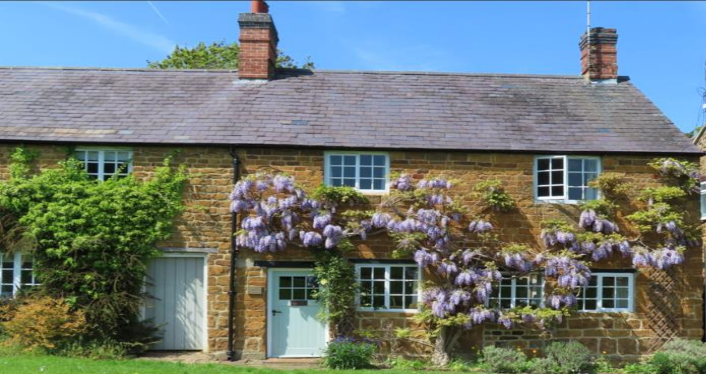
Warmington, Banbury, Warwickshire