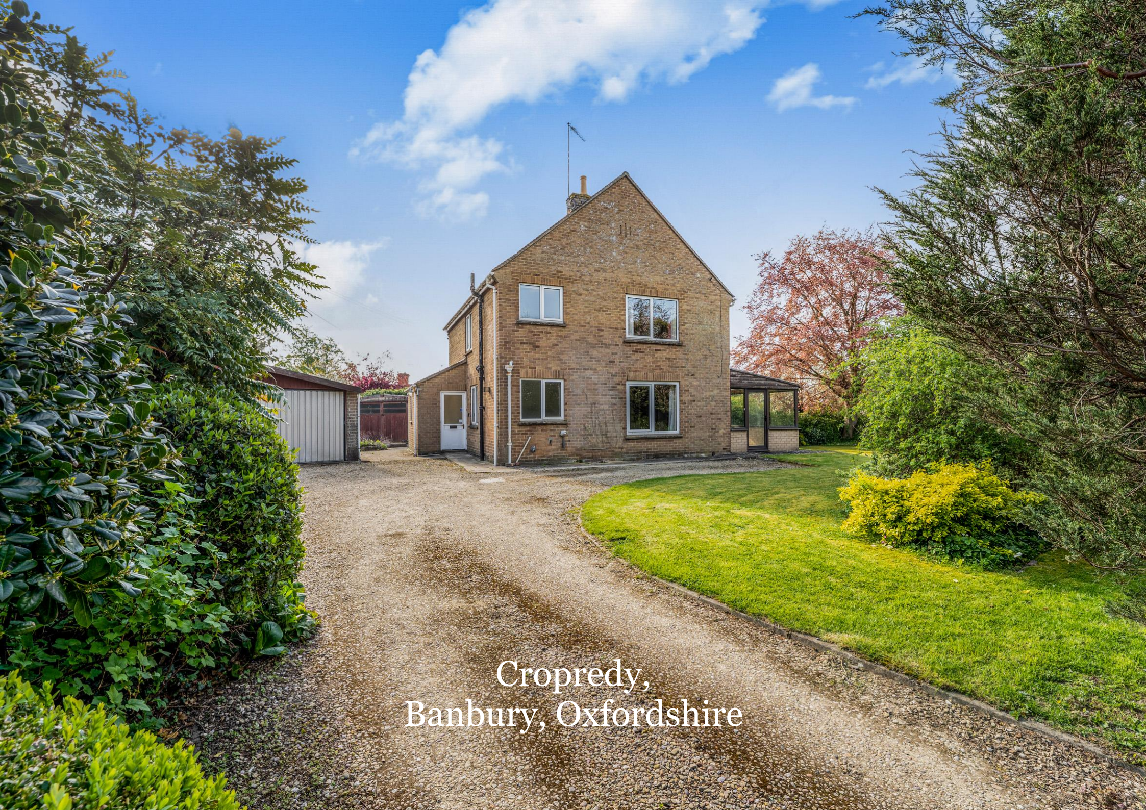
Cropredy, Banbury, Oxfordshire