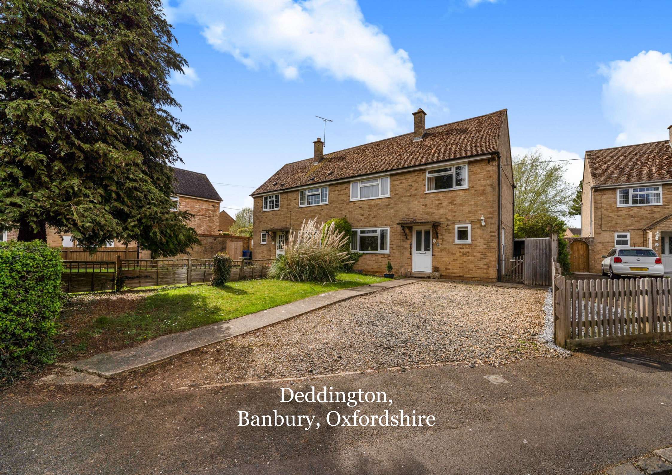
Deddington, Banbury, Oxfordshire