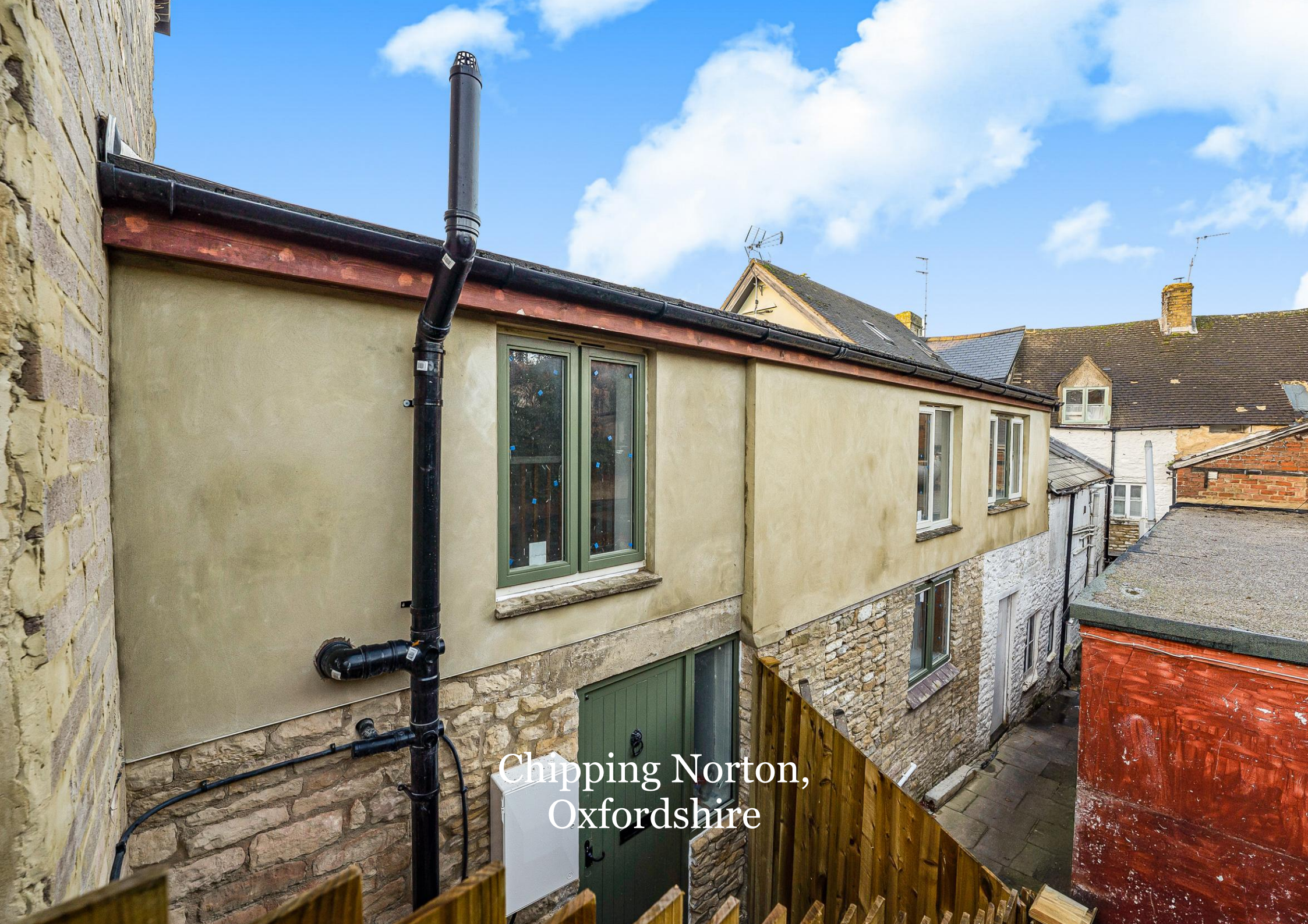
Chipping Norton, Oxfordshire