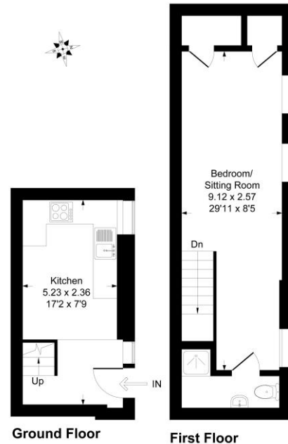
Illustration for identification purpose only, measurements approximate, and not to scale.

Approximate Gross Internal Area = 38.64 sq m / 416 sq ft