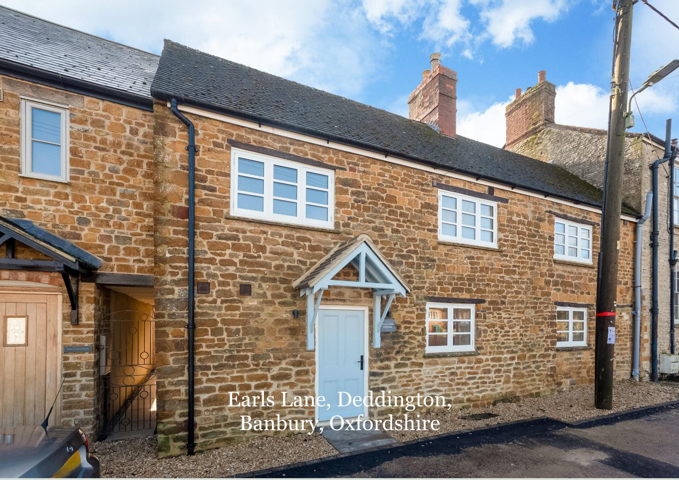
Earls Lane, Deddington, Banbury, Oxfordshire