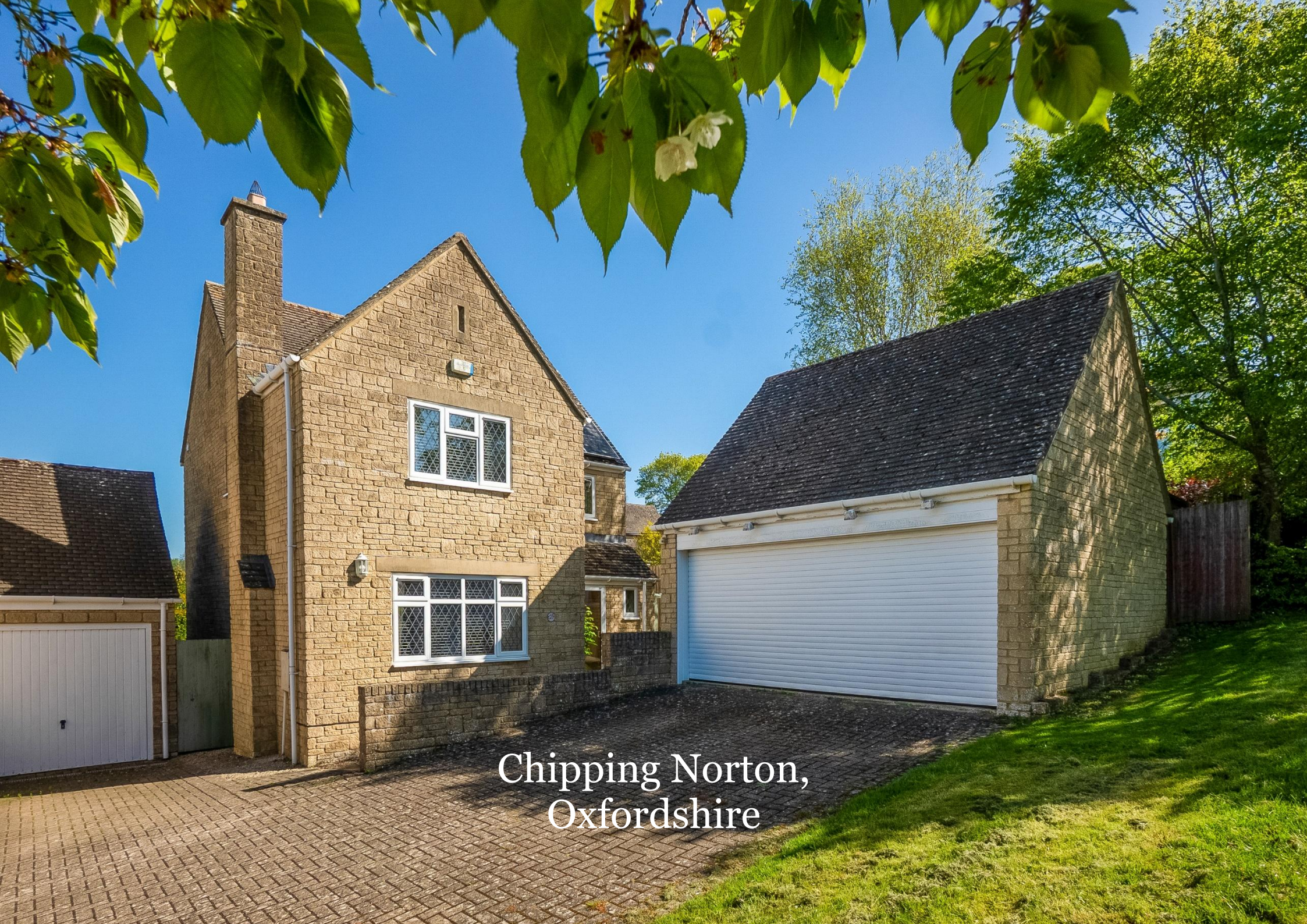
Chipping Norton, Oxfordshire