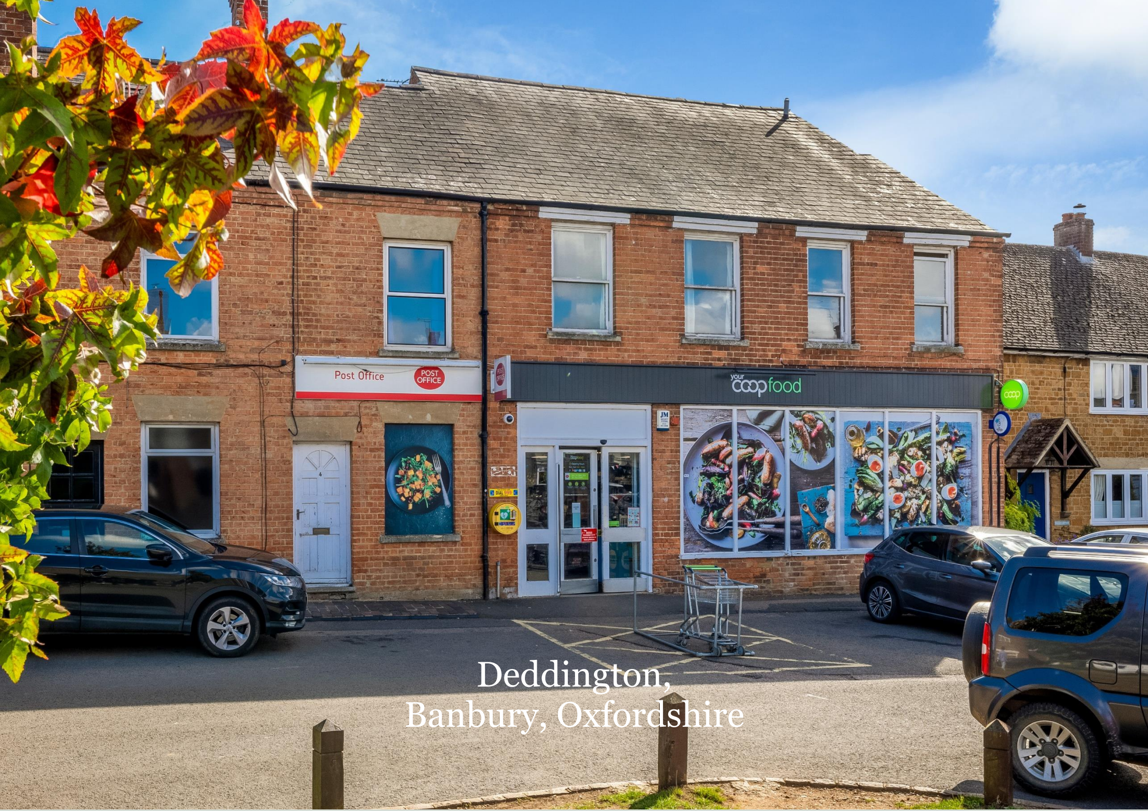
Deddington, Banbury, Oxfordshire