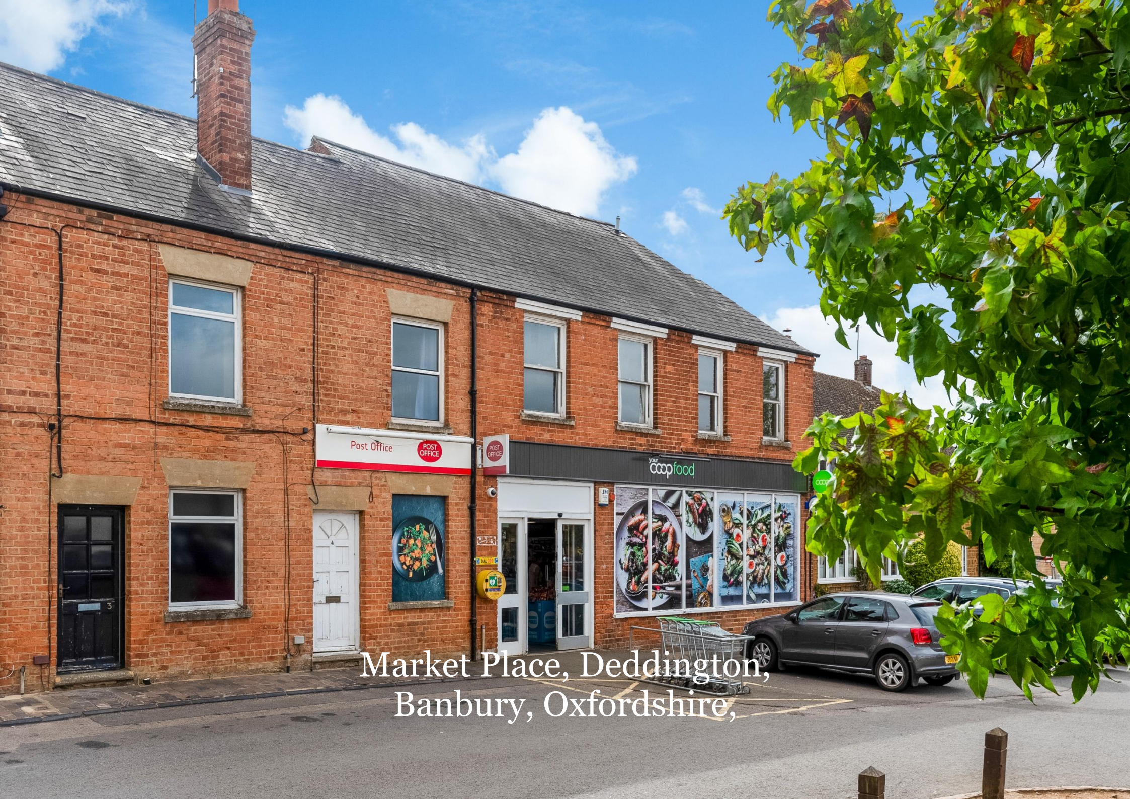
Market Place, Deddington, Banbury, Oxfordshire,