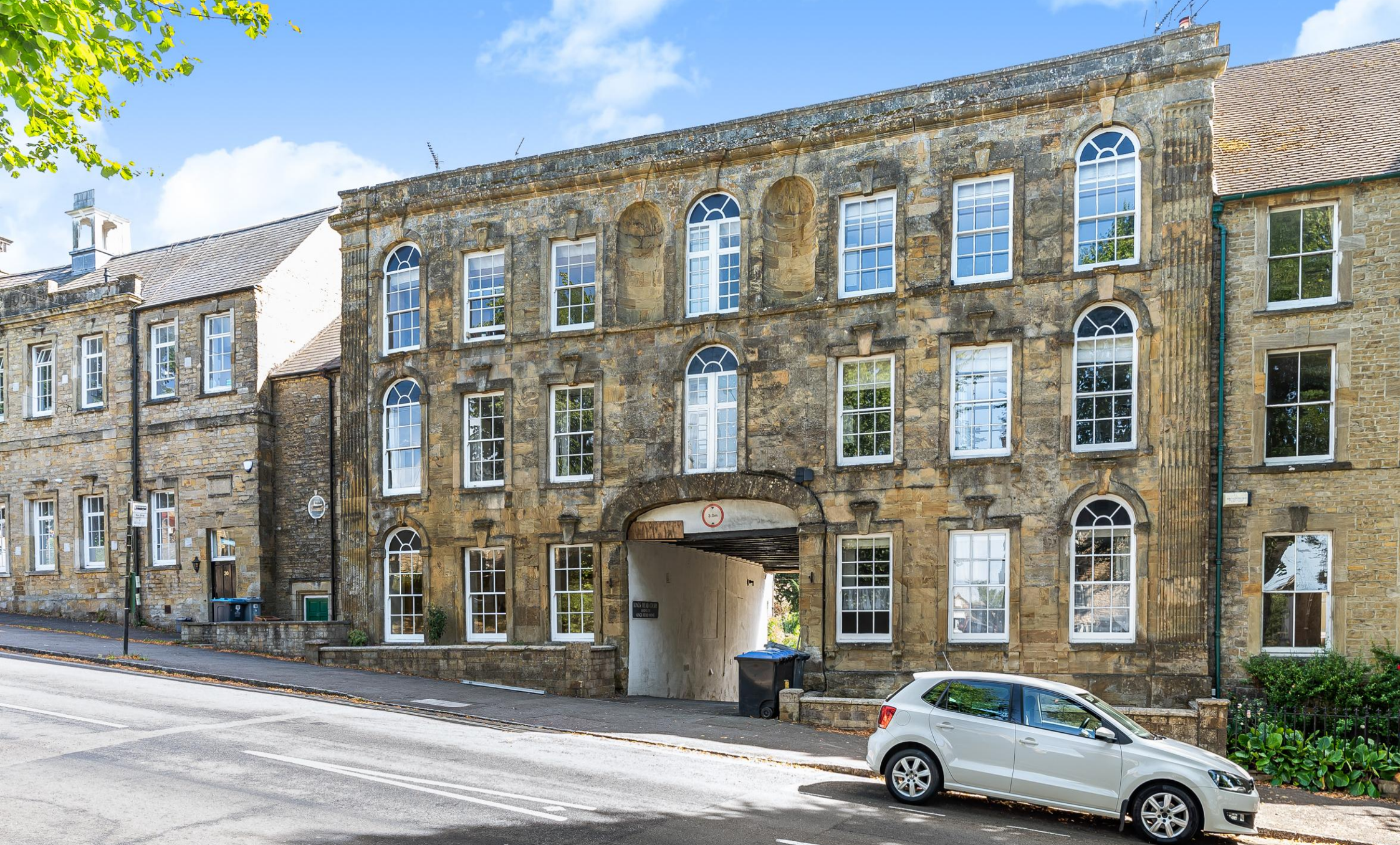
Chipping Norton, Oxfordshire