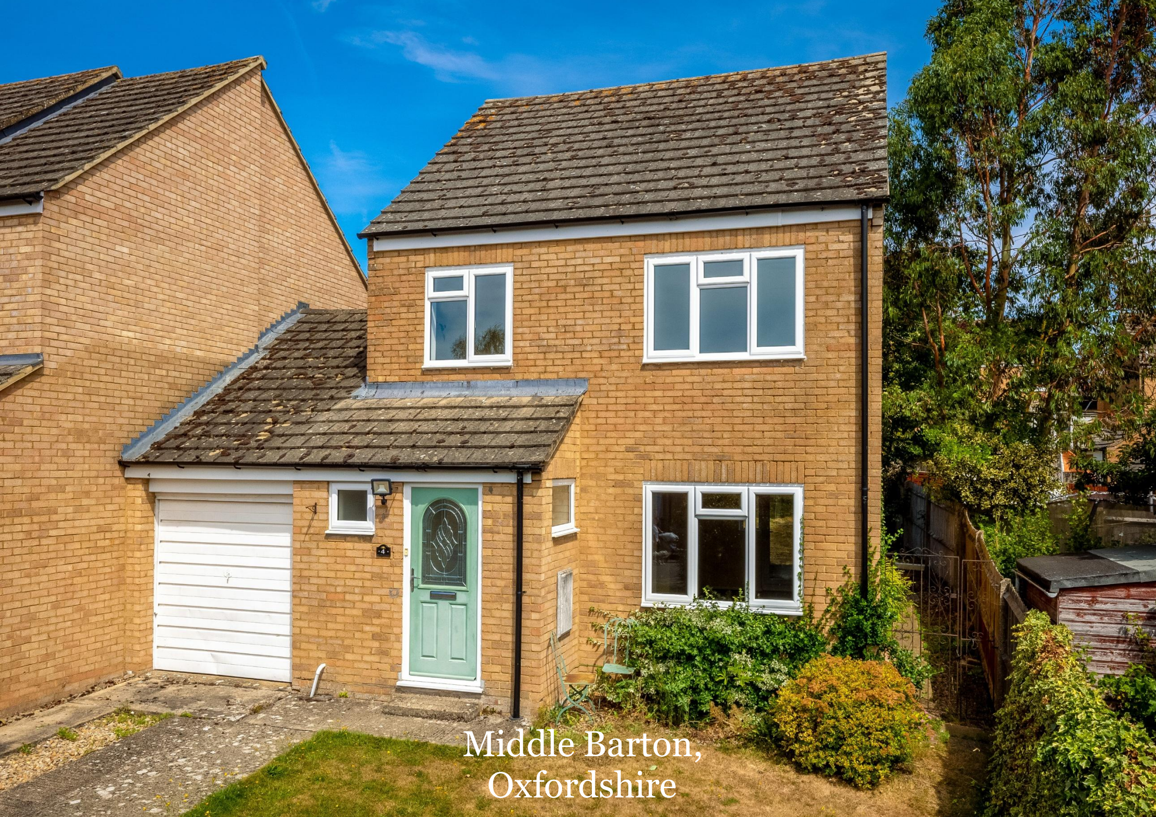
Middle Barton, Oxfordshire