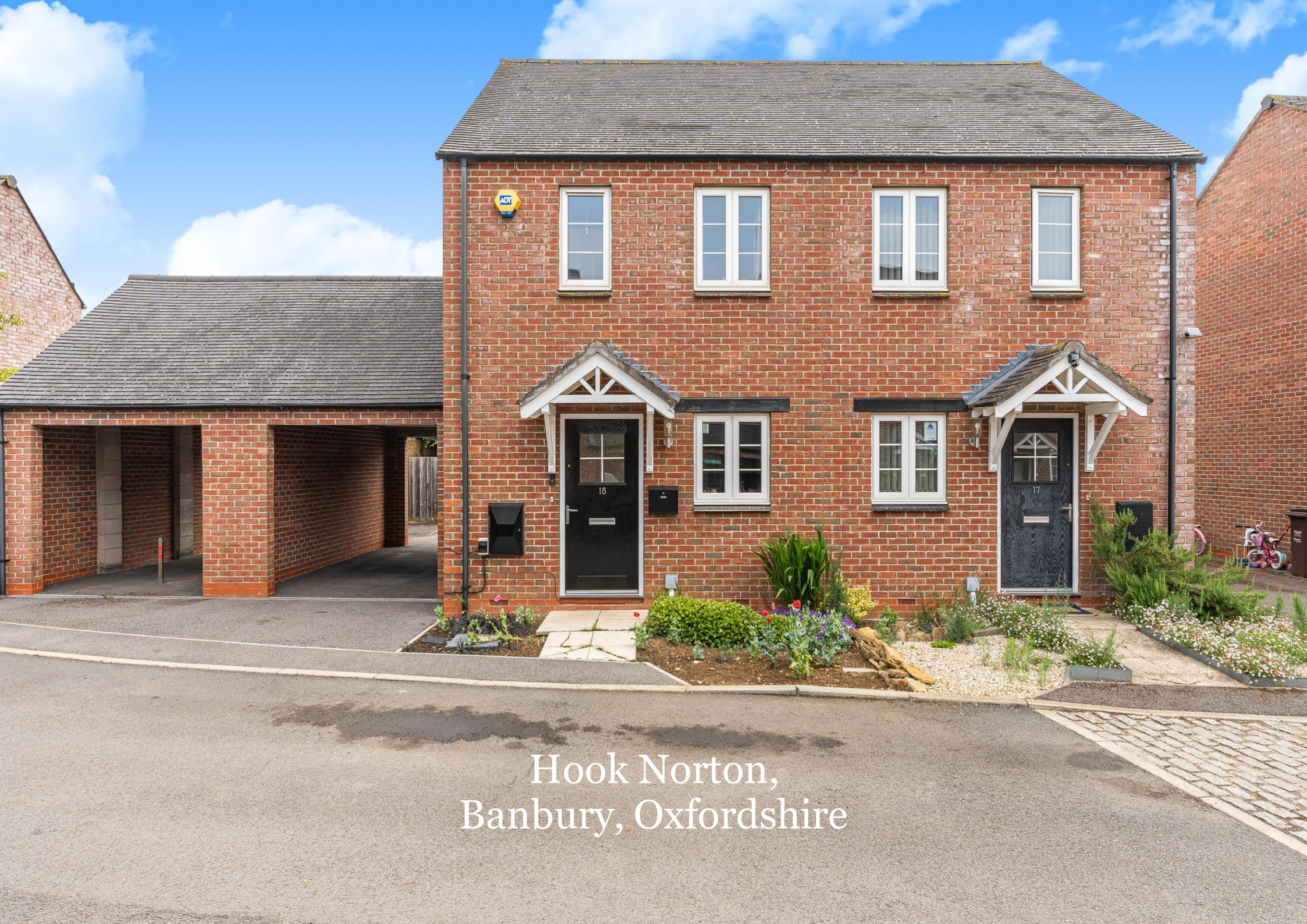
Hook Norton, Banbury, Oxfordshire