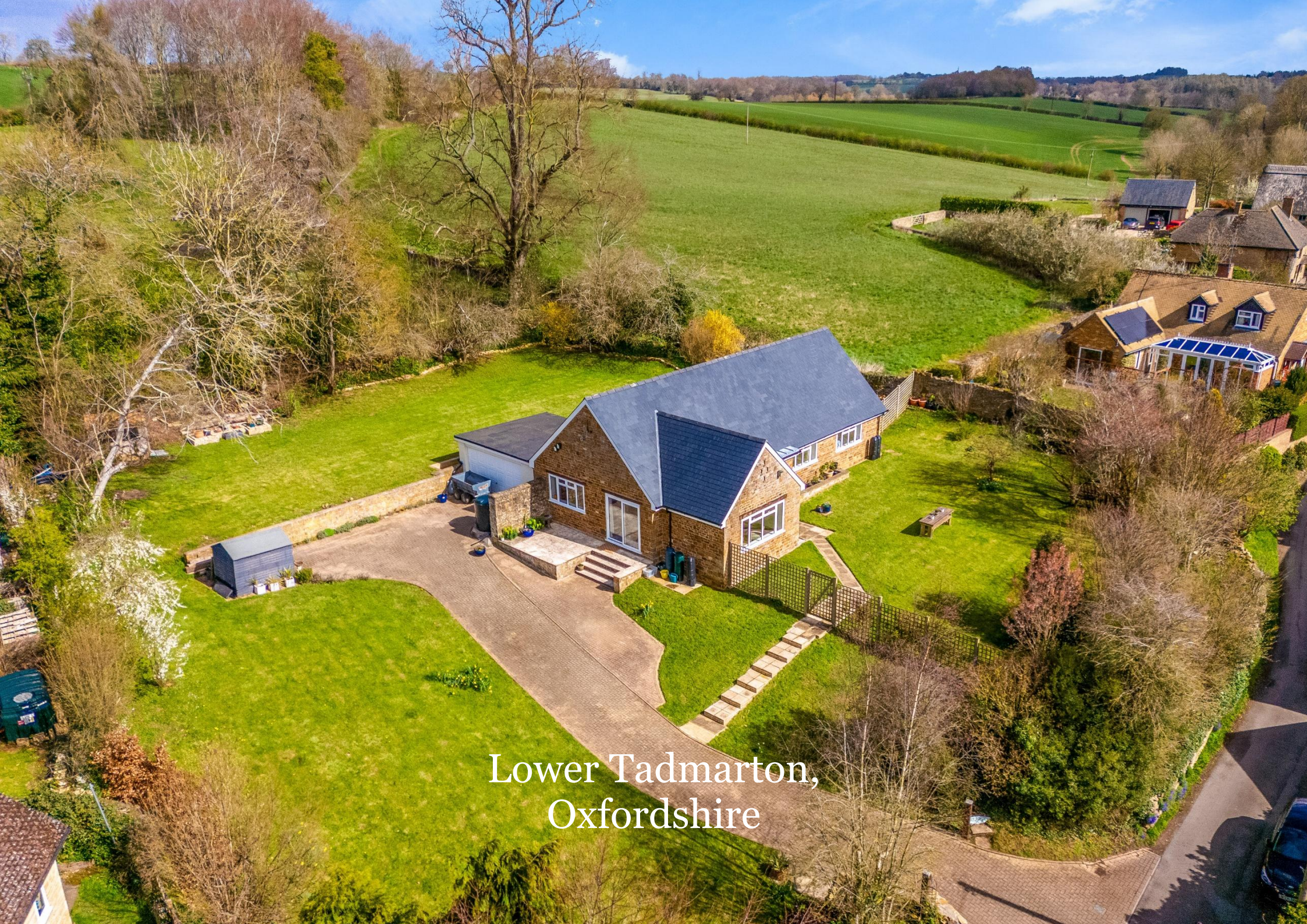
Lower Tadmarton, Oxfordshire