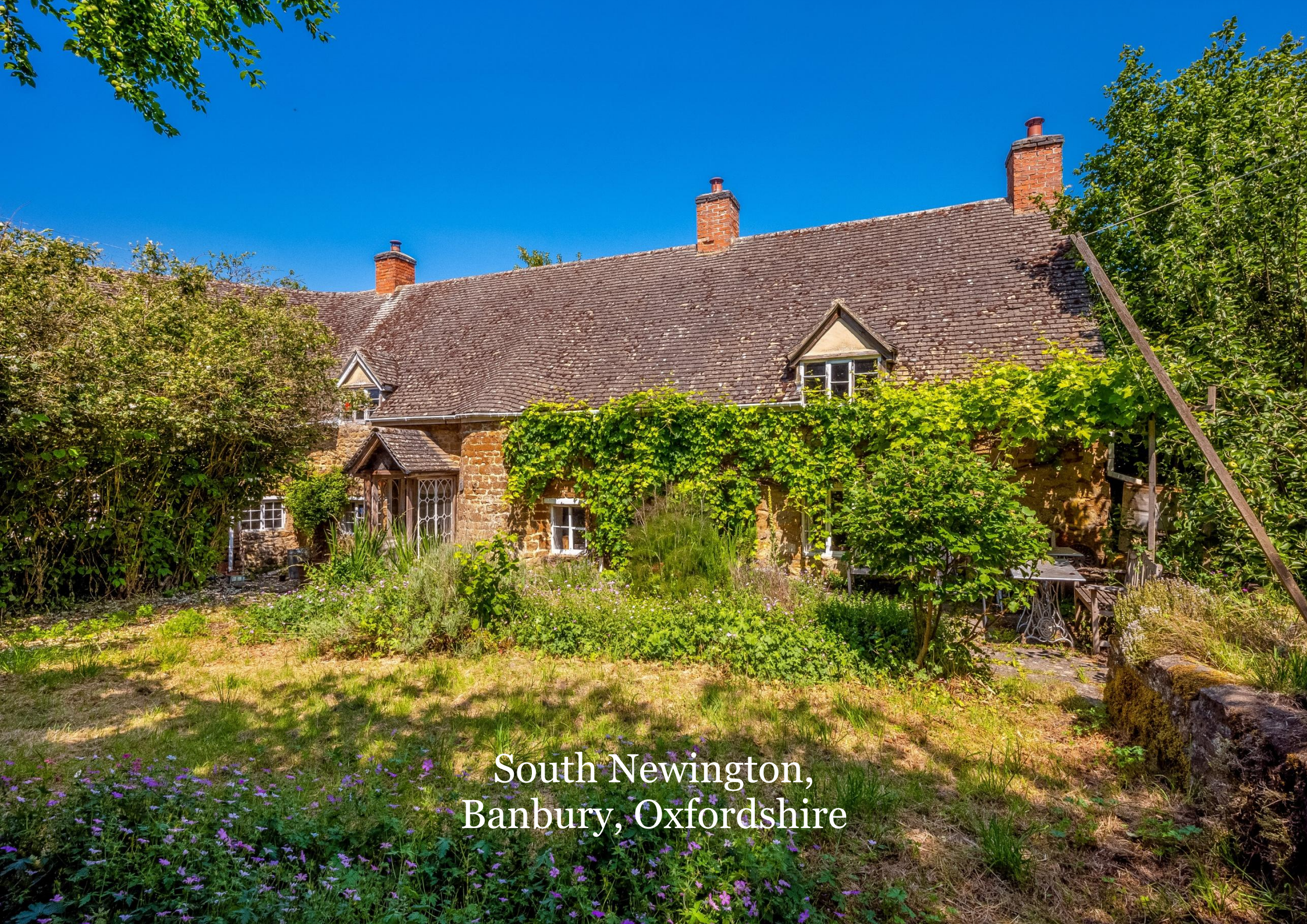
South Newington, Banbury, Oxfordshire