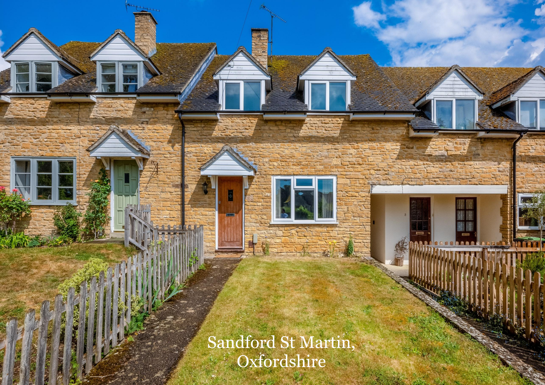
Sandford St Martin, Oxfordshire