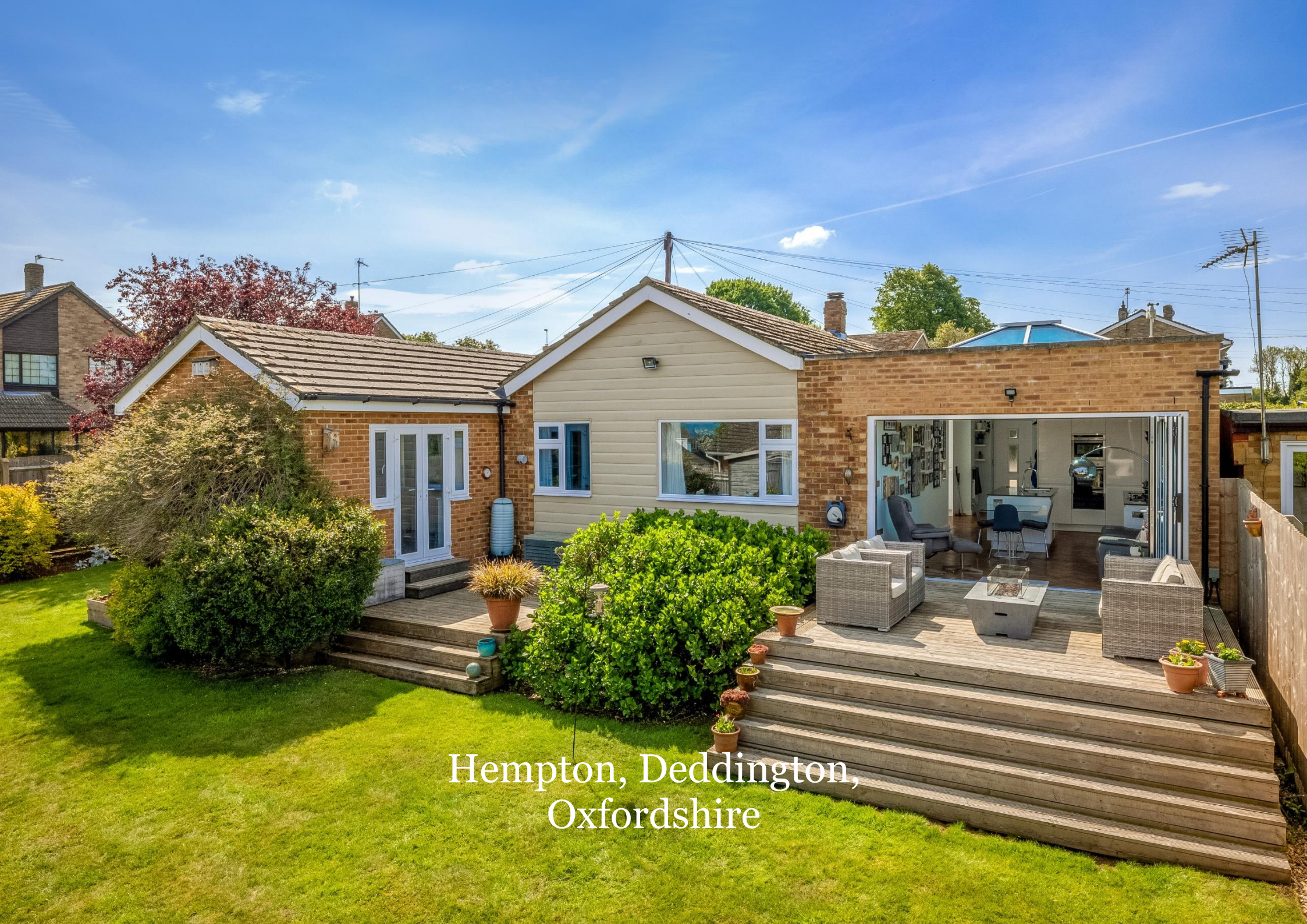
Hempton, Deddington, Oxfordshire