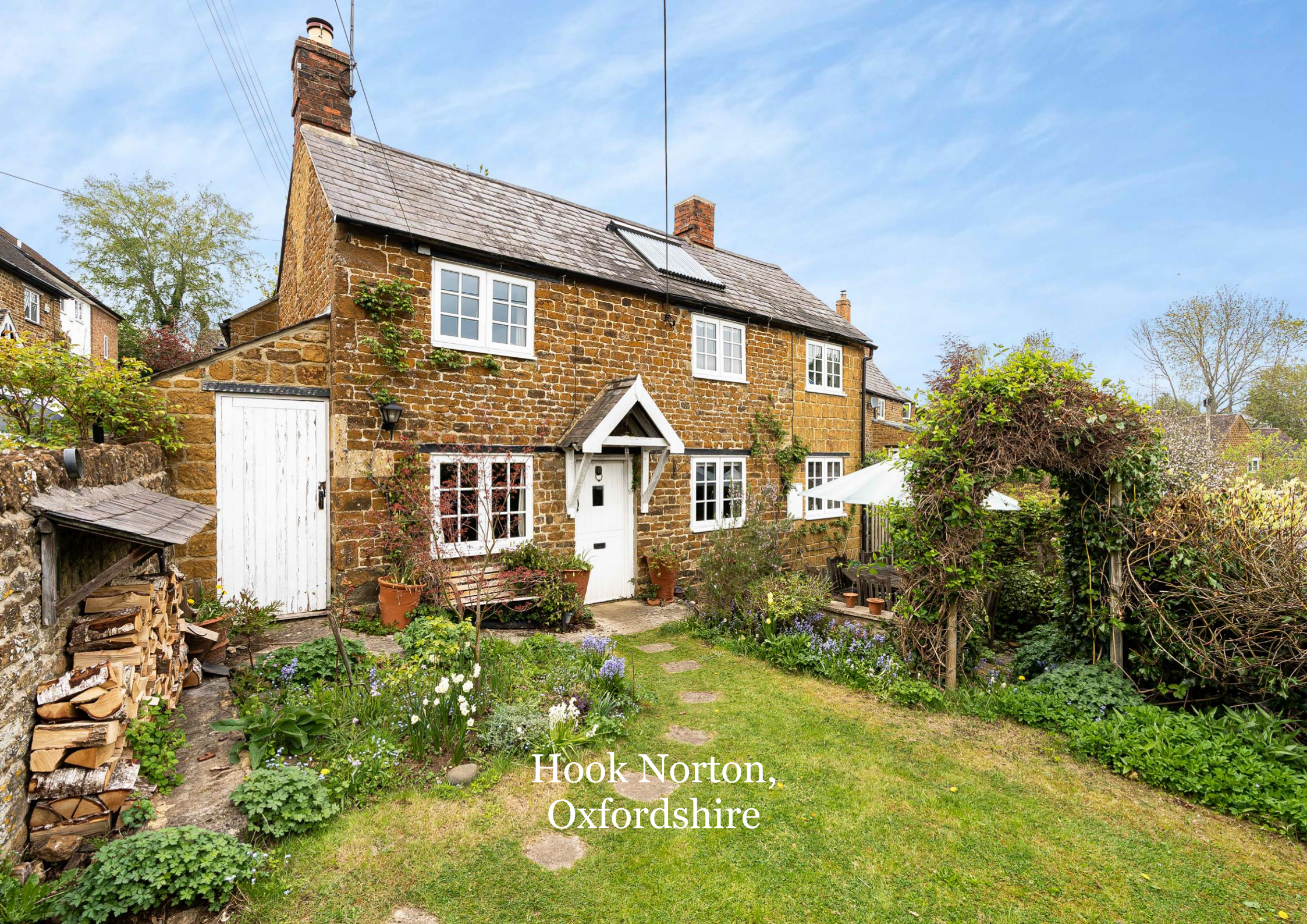
Hook Norton, Oxfordshire