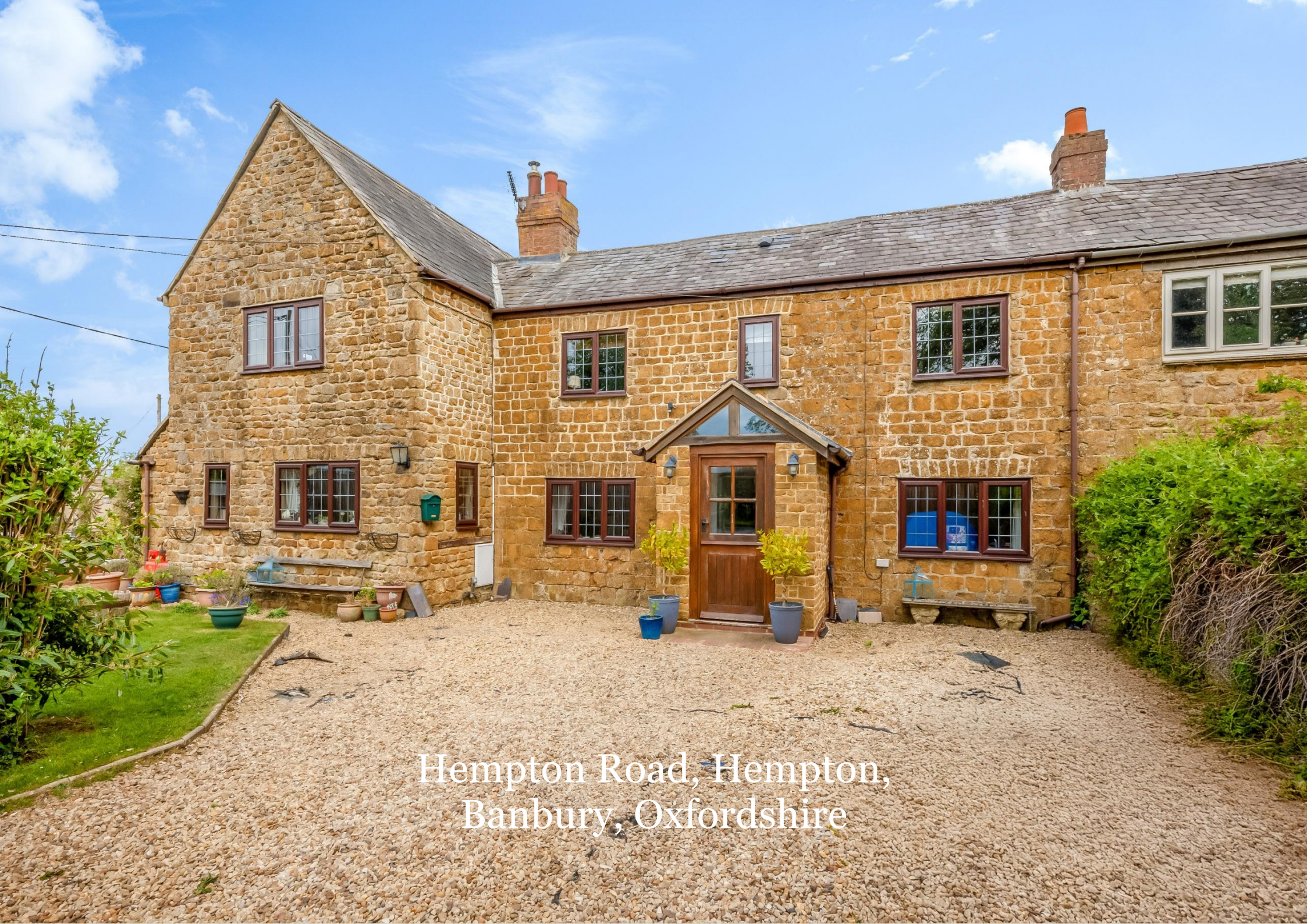
Hempton Road, Hempton, Banbury, Oxfordshire