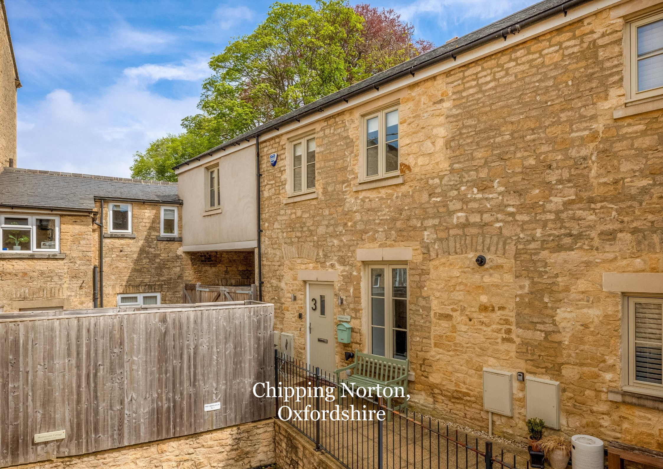
Chipping Norton, Oxfordshire