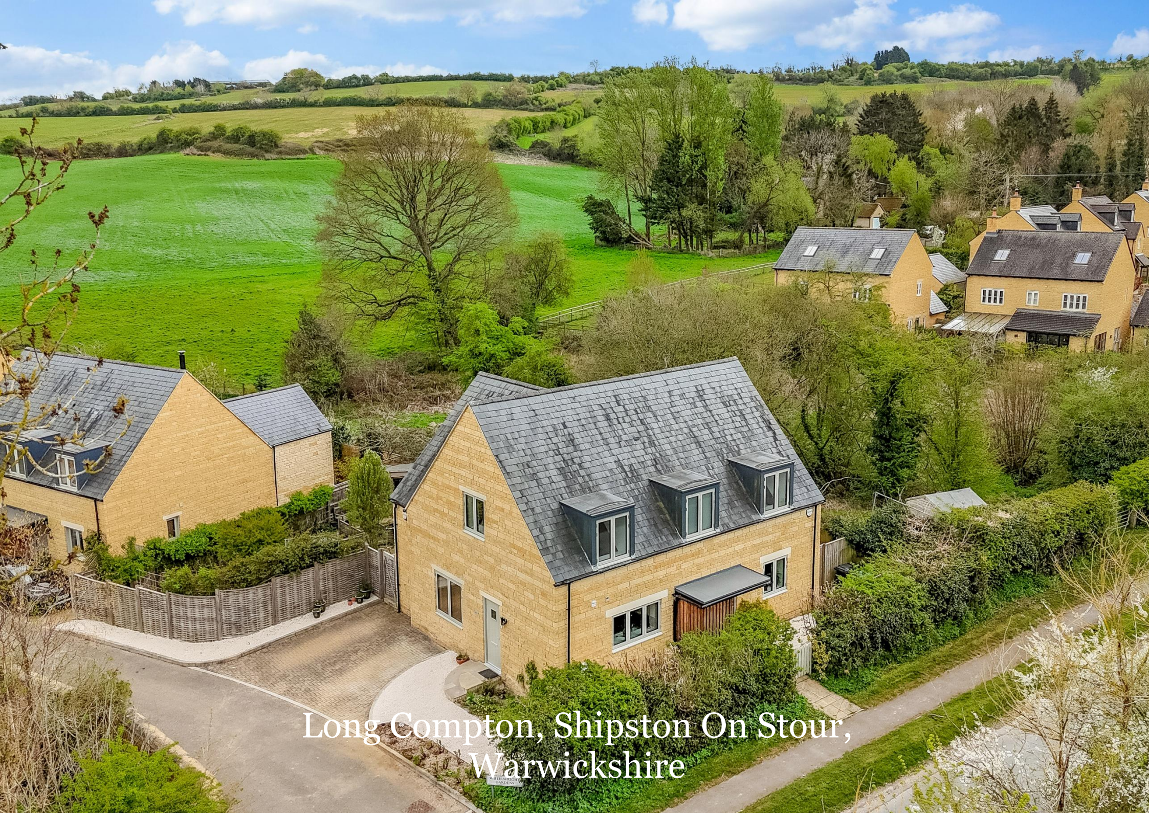
Long Compton, Shipston On Stour, Warwickshire