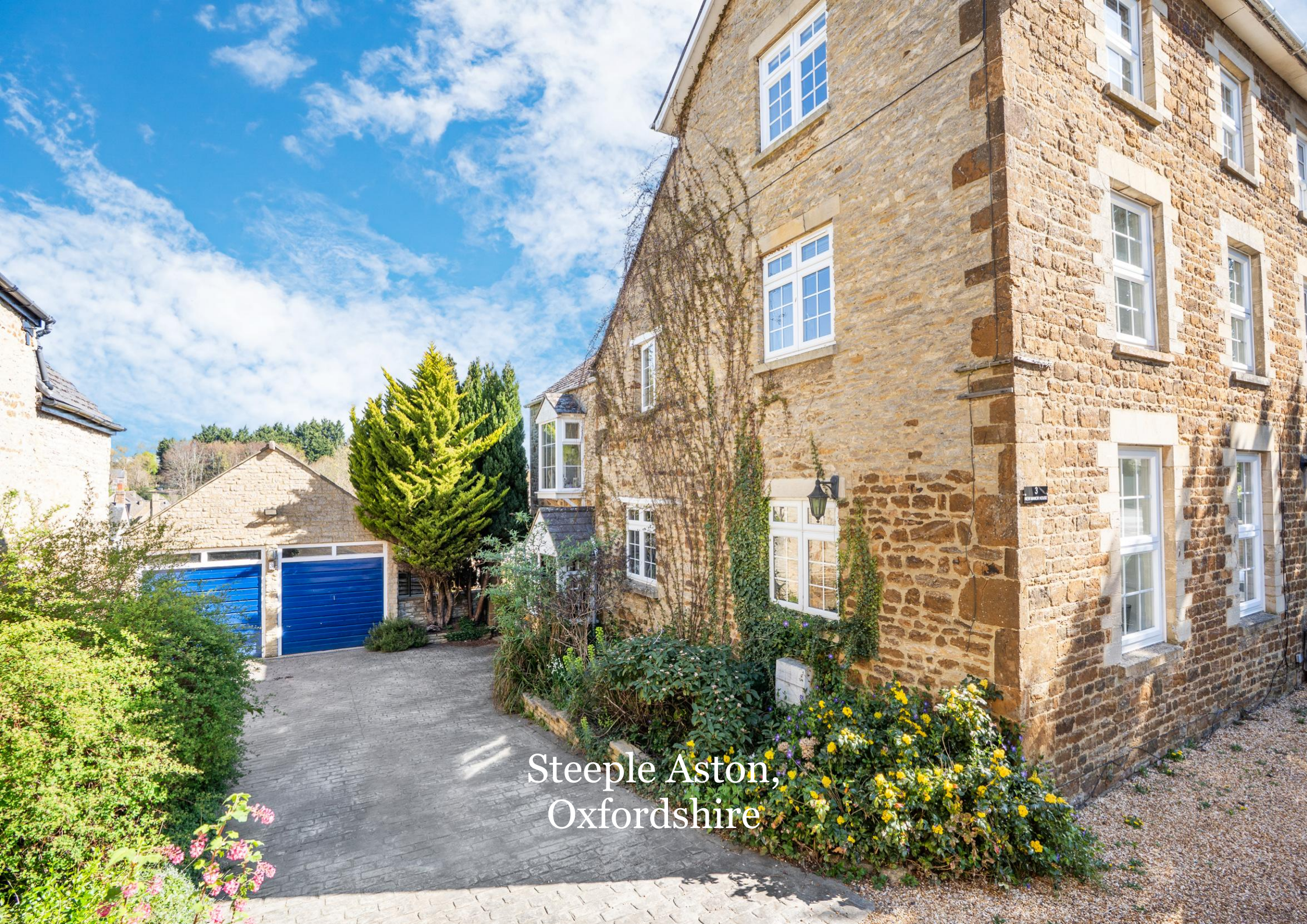
Steeple Aston, Oxfordshire