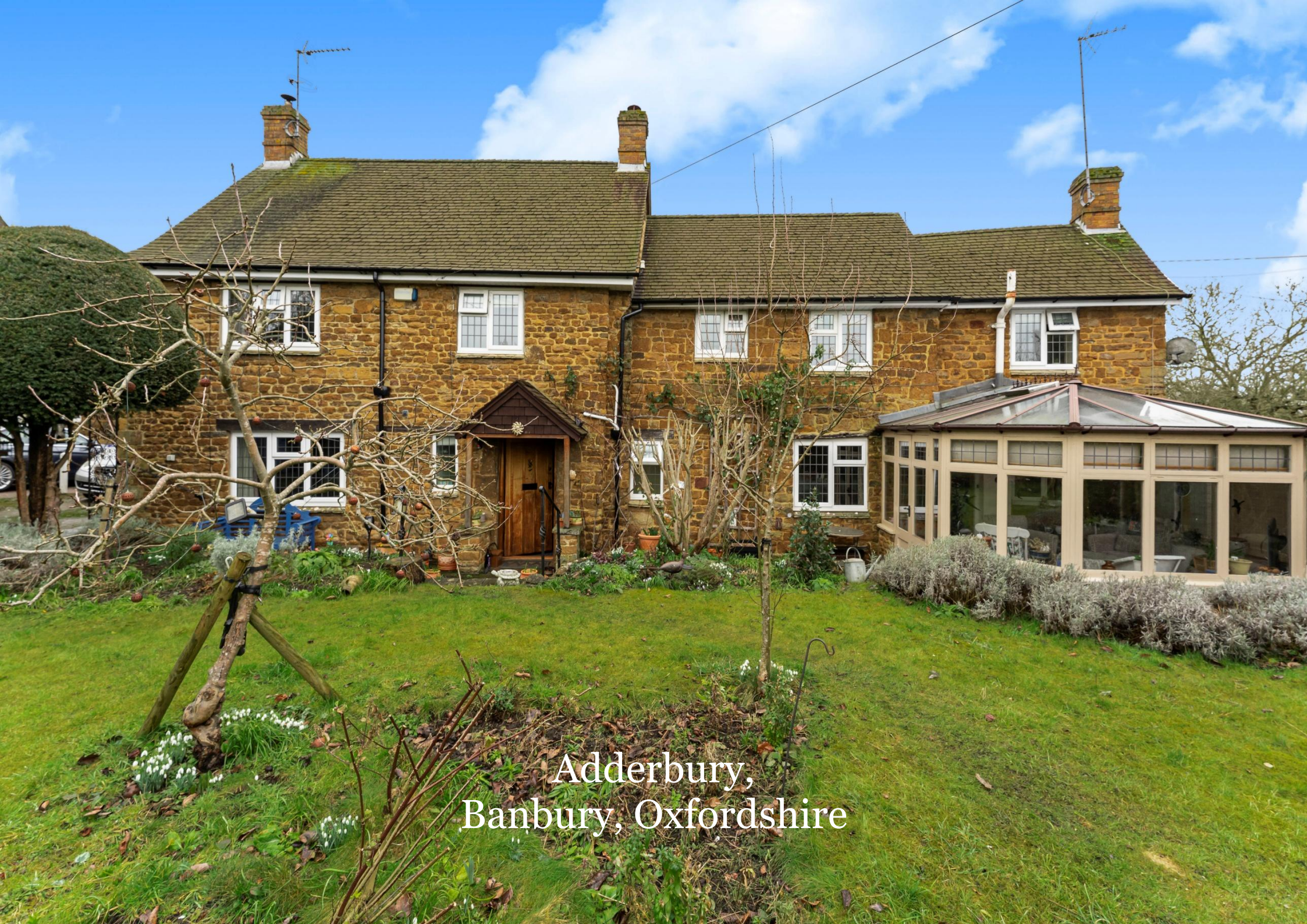
Adderbury, Banbury, Oxfordshire