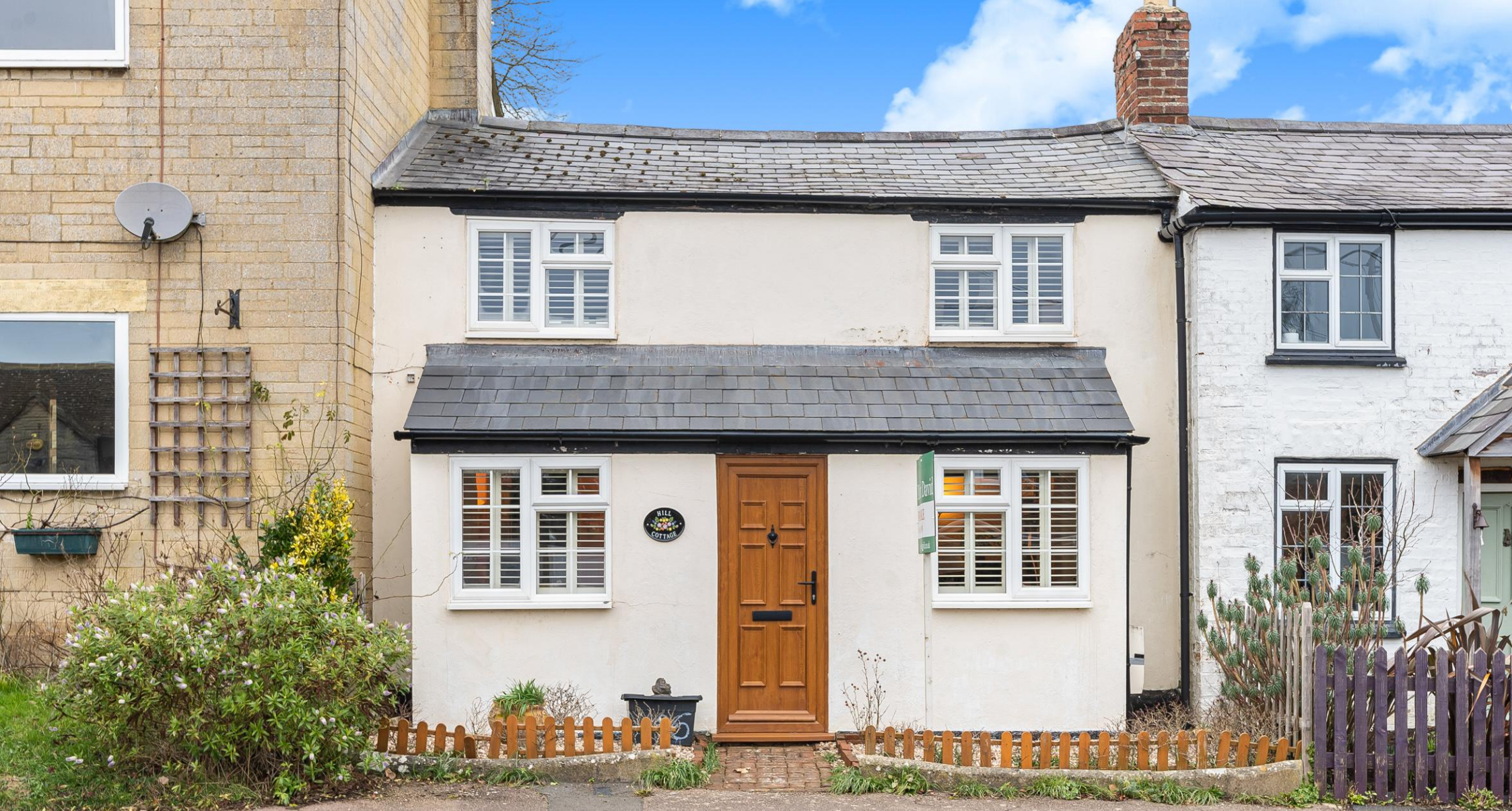
Middle Barton, Chipping Norton, Oxfordshire