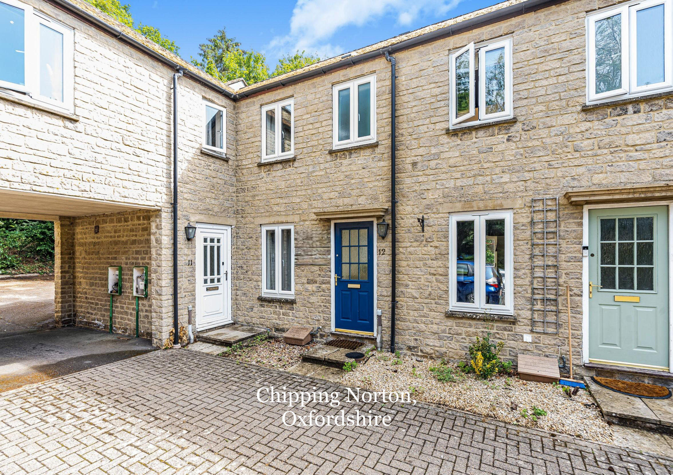
Chipping Norton, Oxfordshire