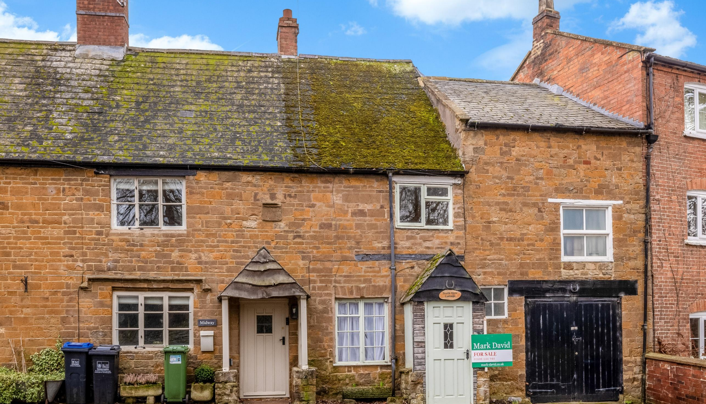
North View, High Street, Lower Brailes, Banbury, Oxfordshire, OX15 5HW