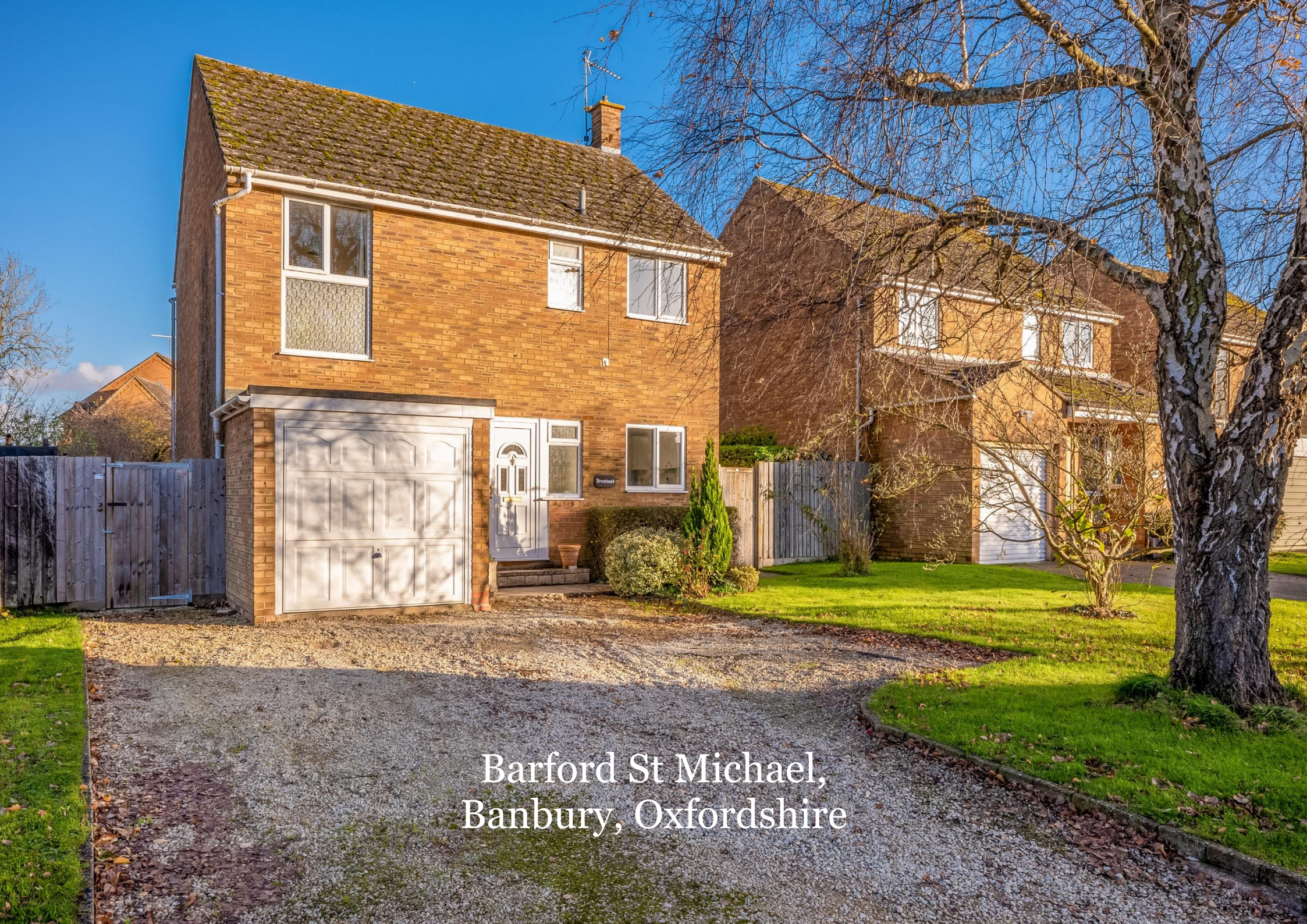
Barford St Michael, Banbury, Oxfordshire