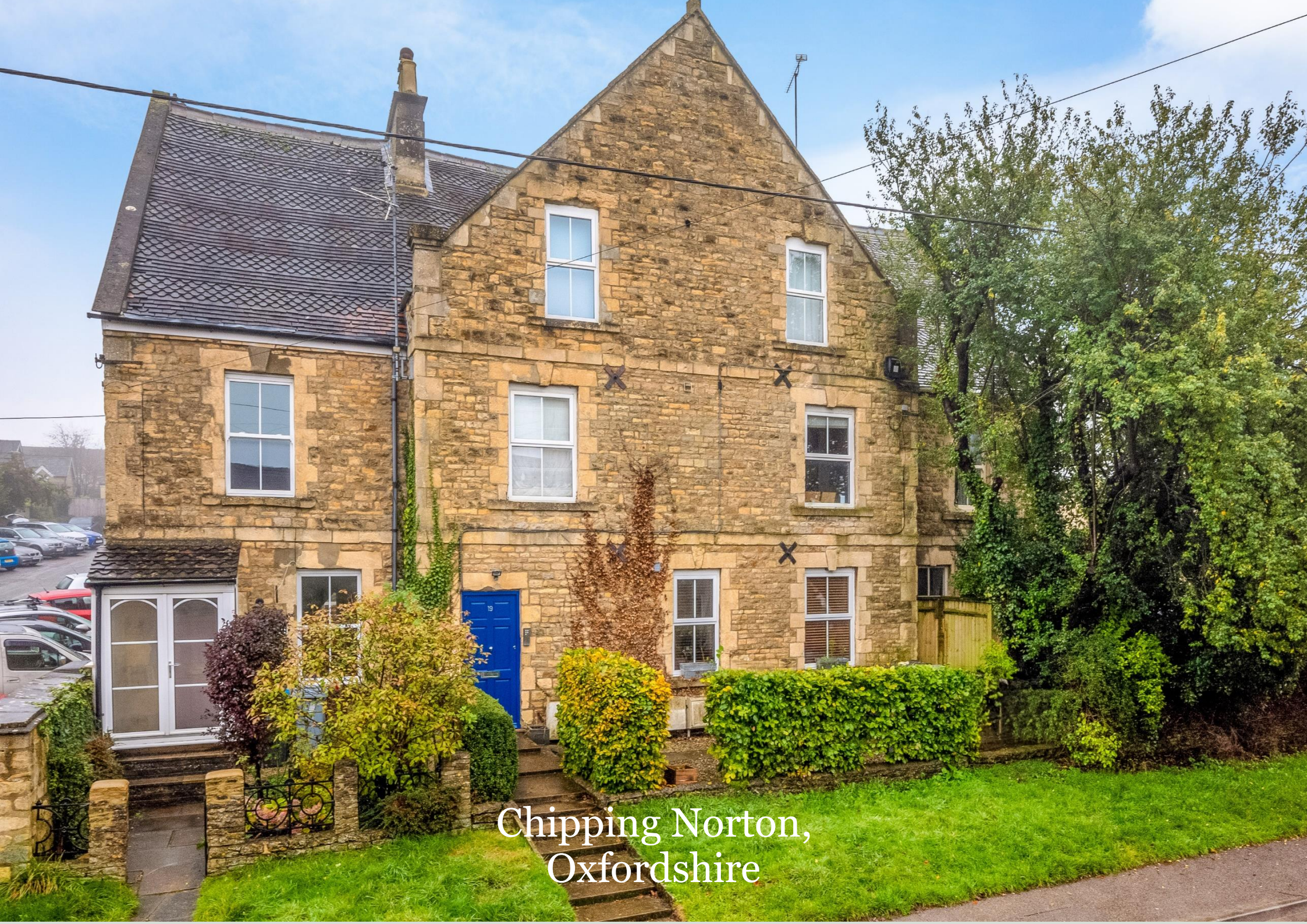
Chipping Norton, Oxfordshire