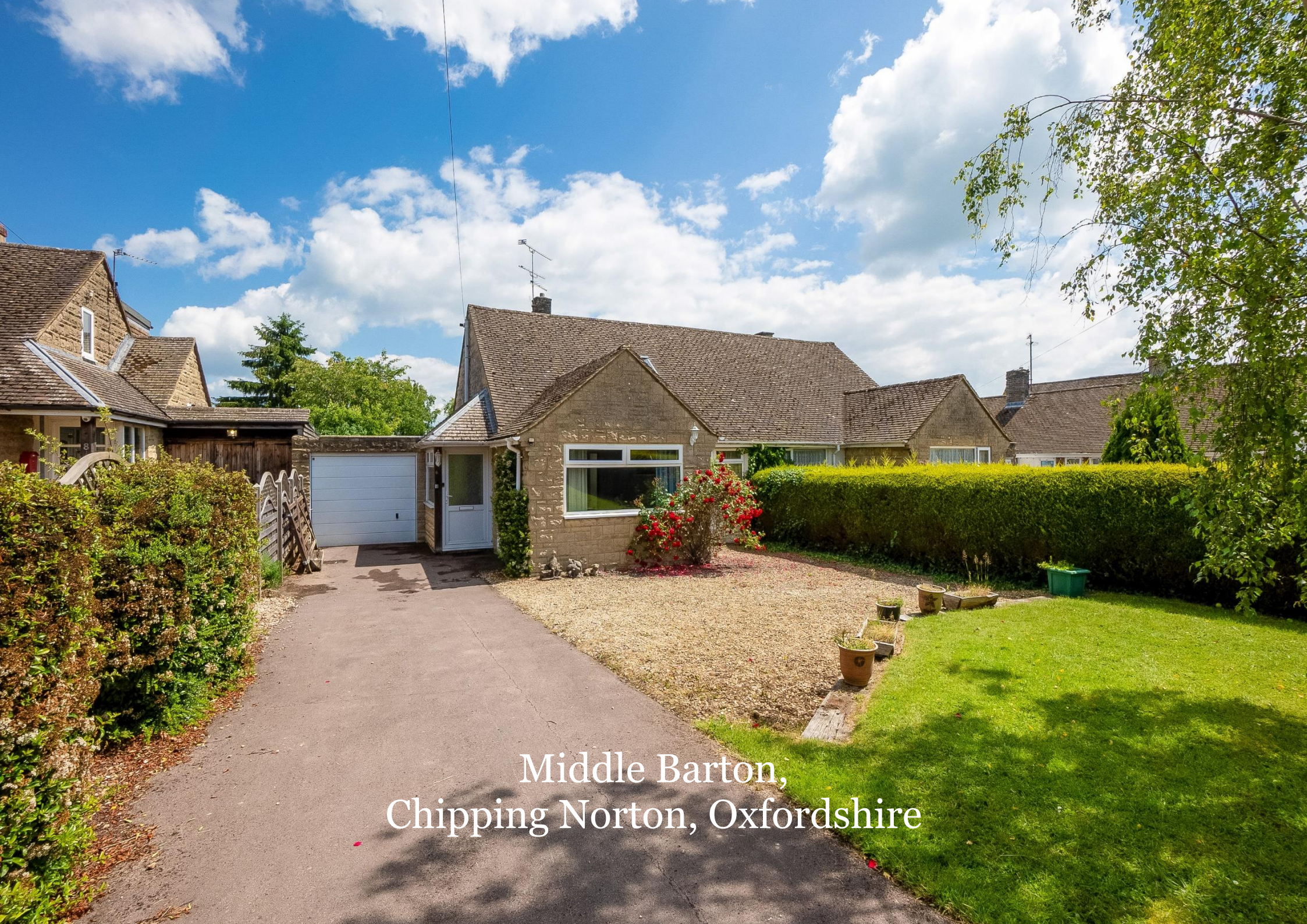
Middle Barton, Chipping Norton, Oxfordshire