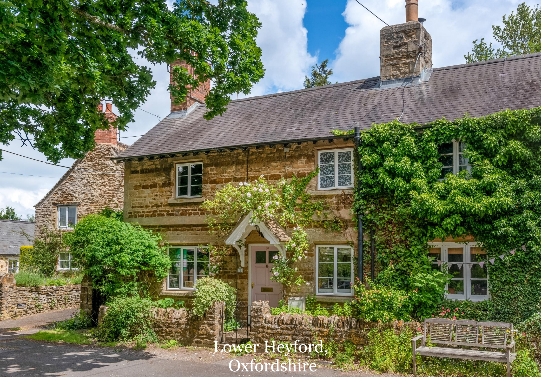
Lower Heyford, Oxfordshire