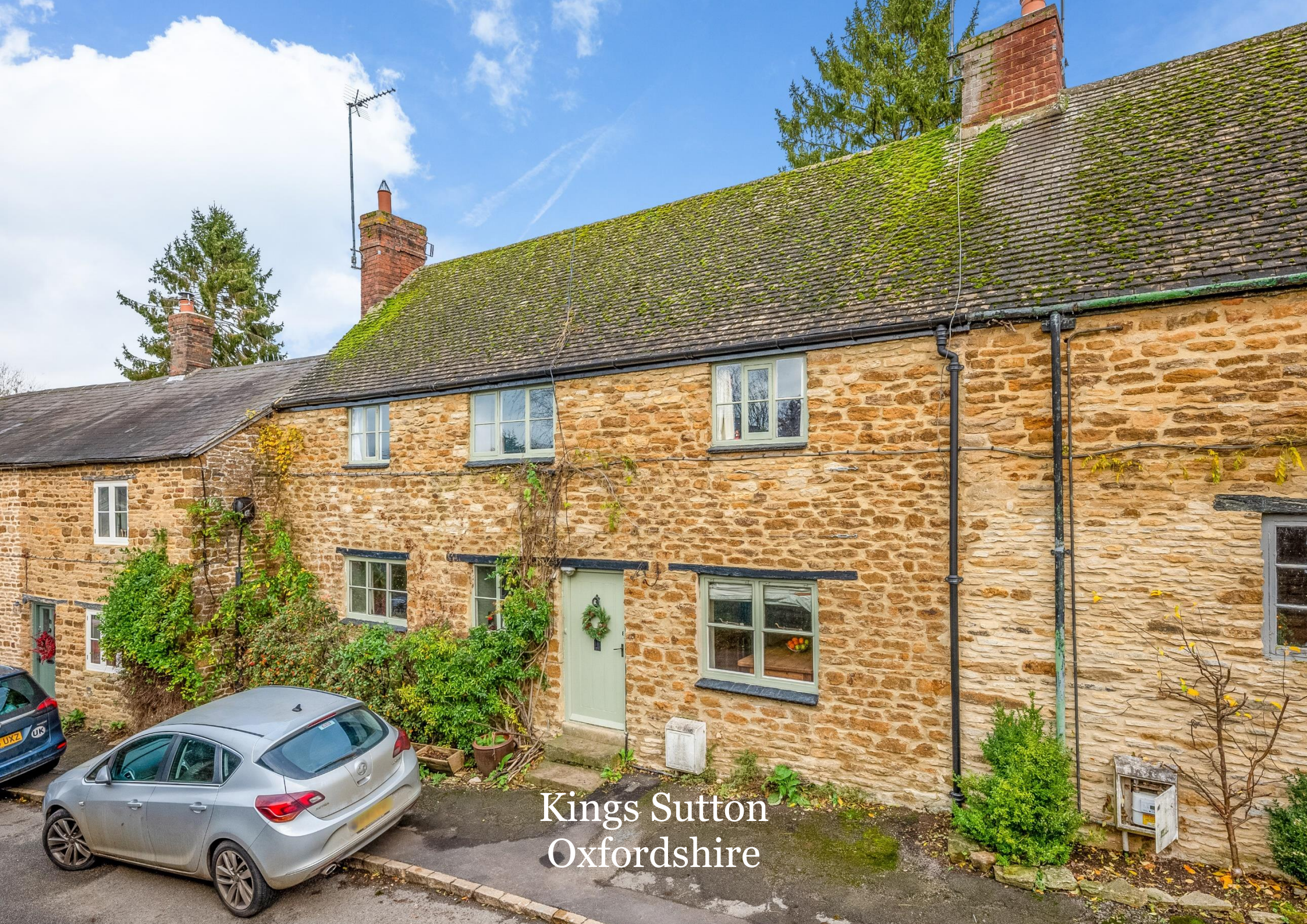
Kings Sutton Oxfordshire