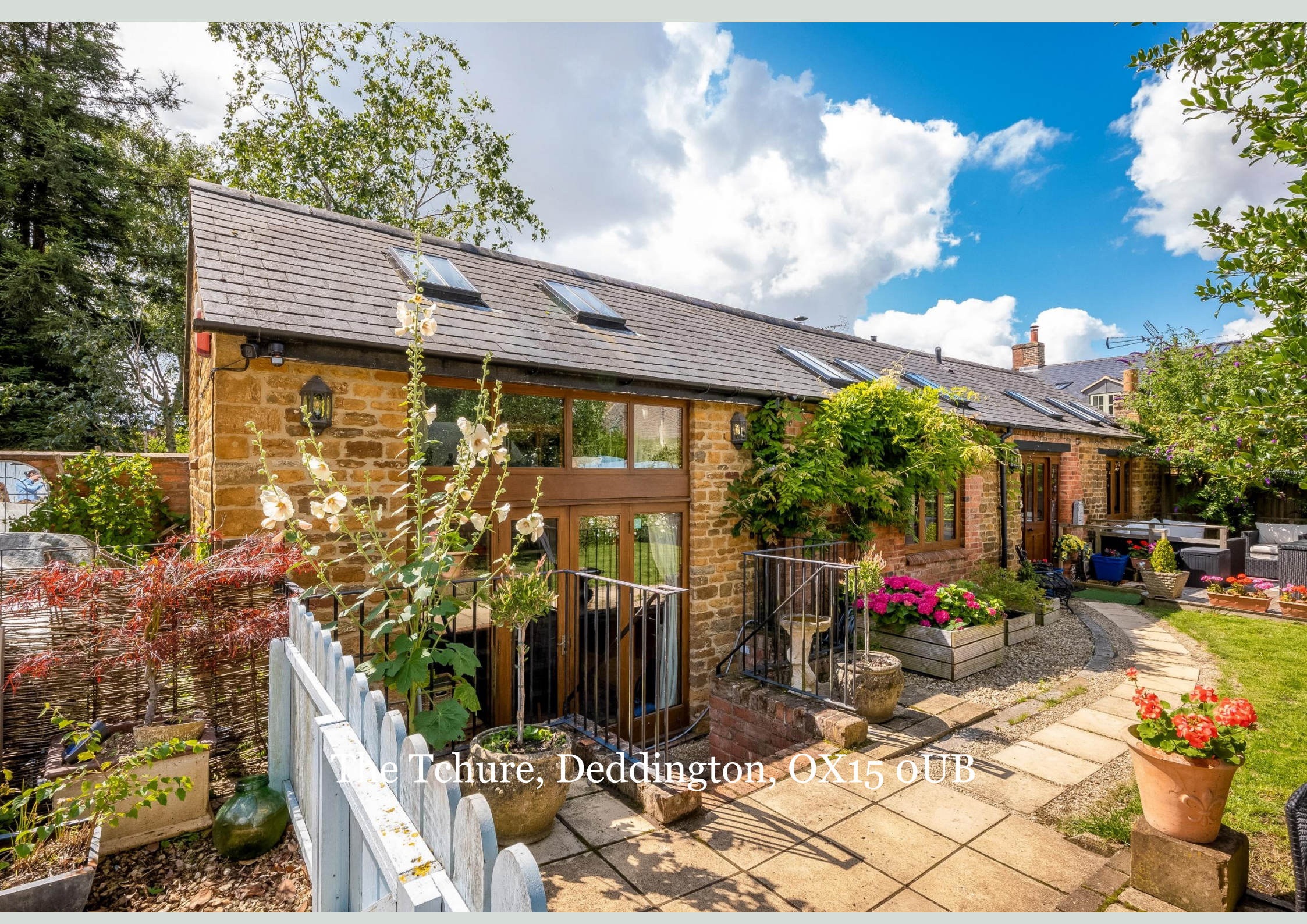
The Tchire, Deddington, OX15 0UB