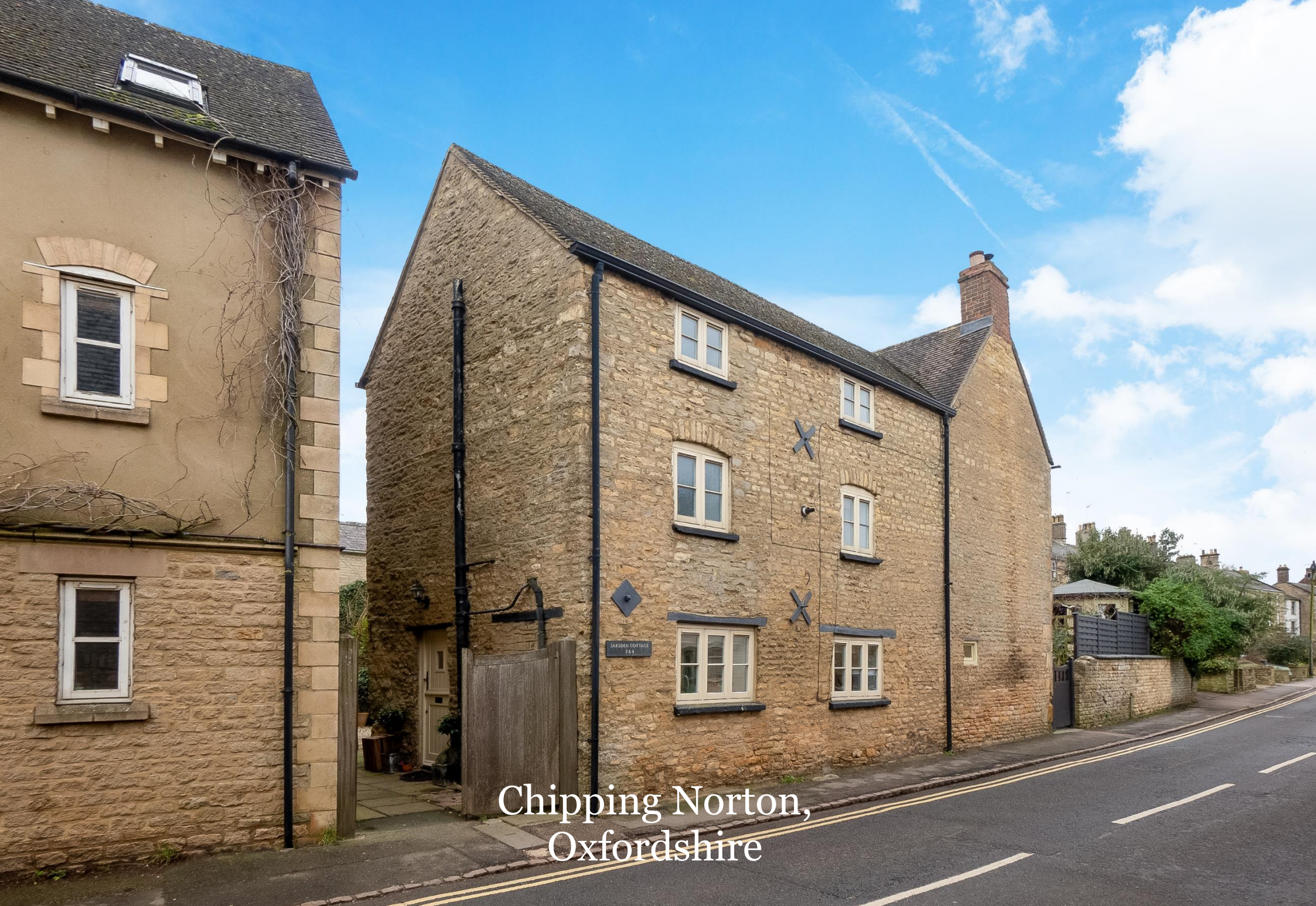
Chipping Norton, Oxfordshire