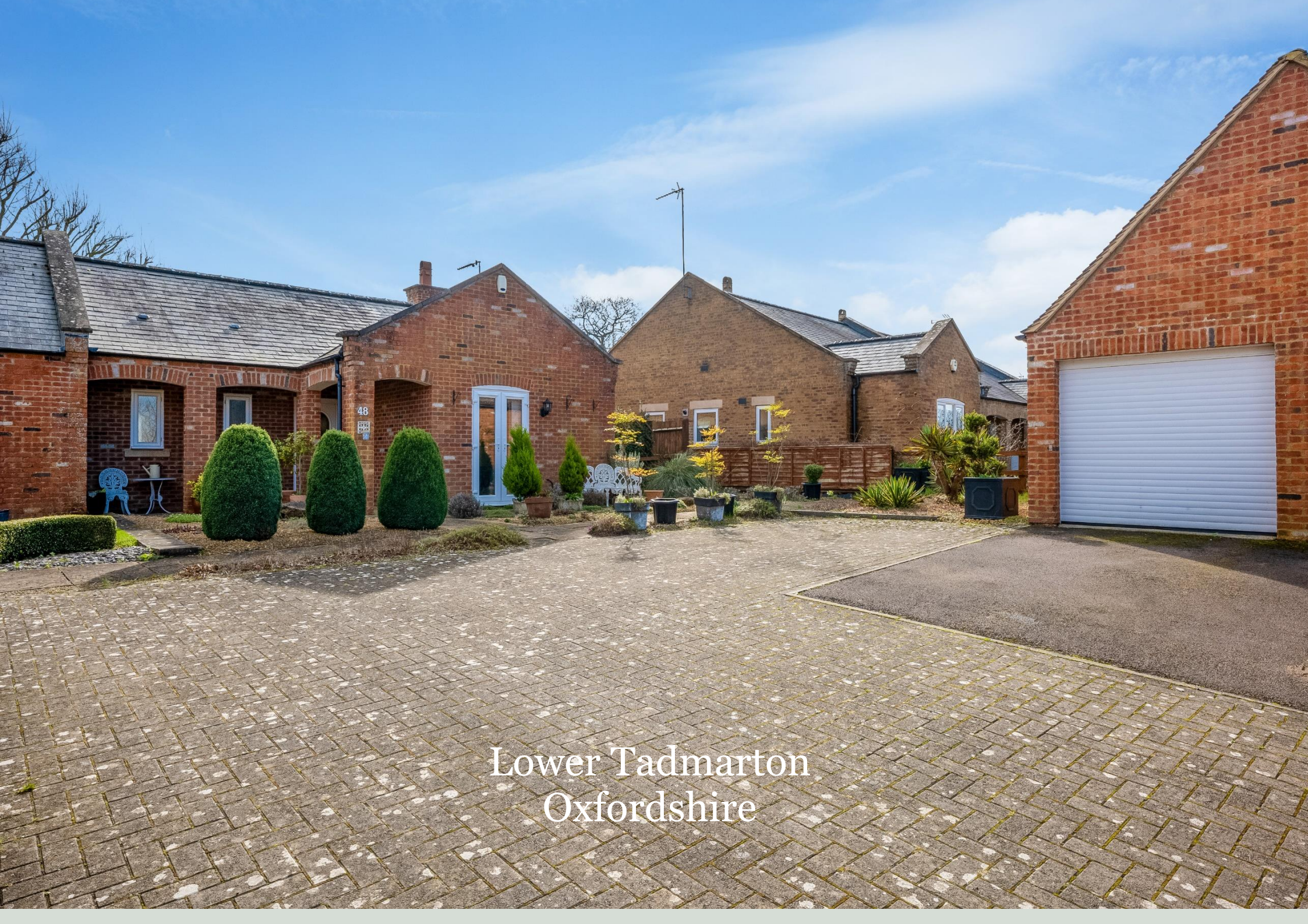
Lower Tadmarton Oxfordshire