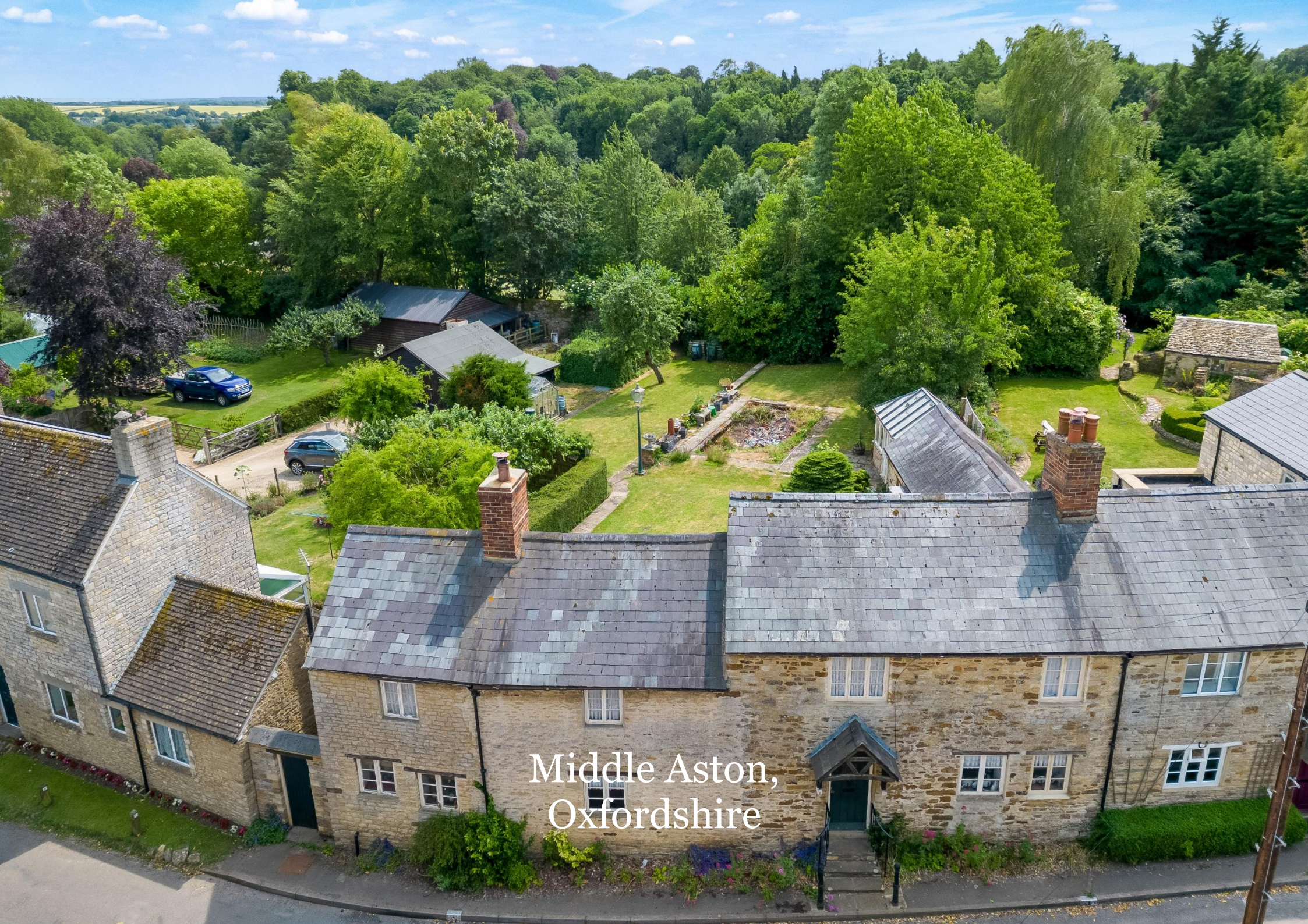
Middle Aston, Oxfordshire