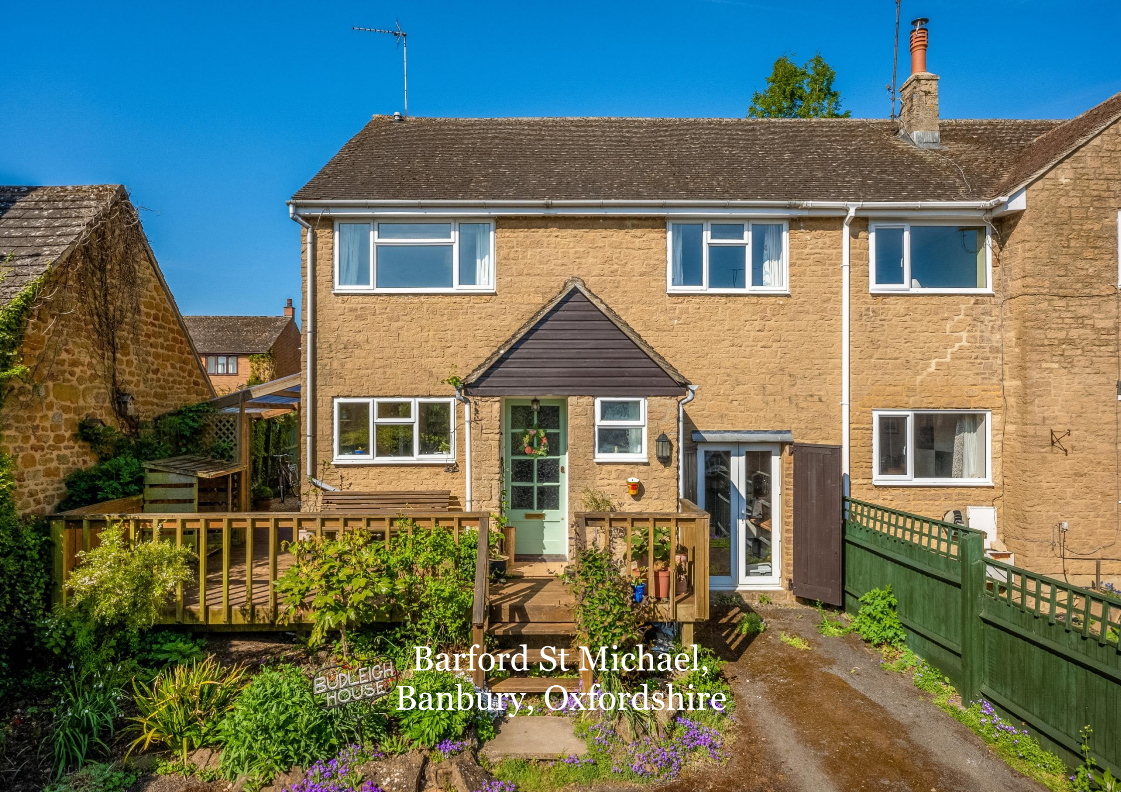
Barford St Michael, Banbury, Oxfordshire