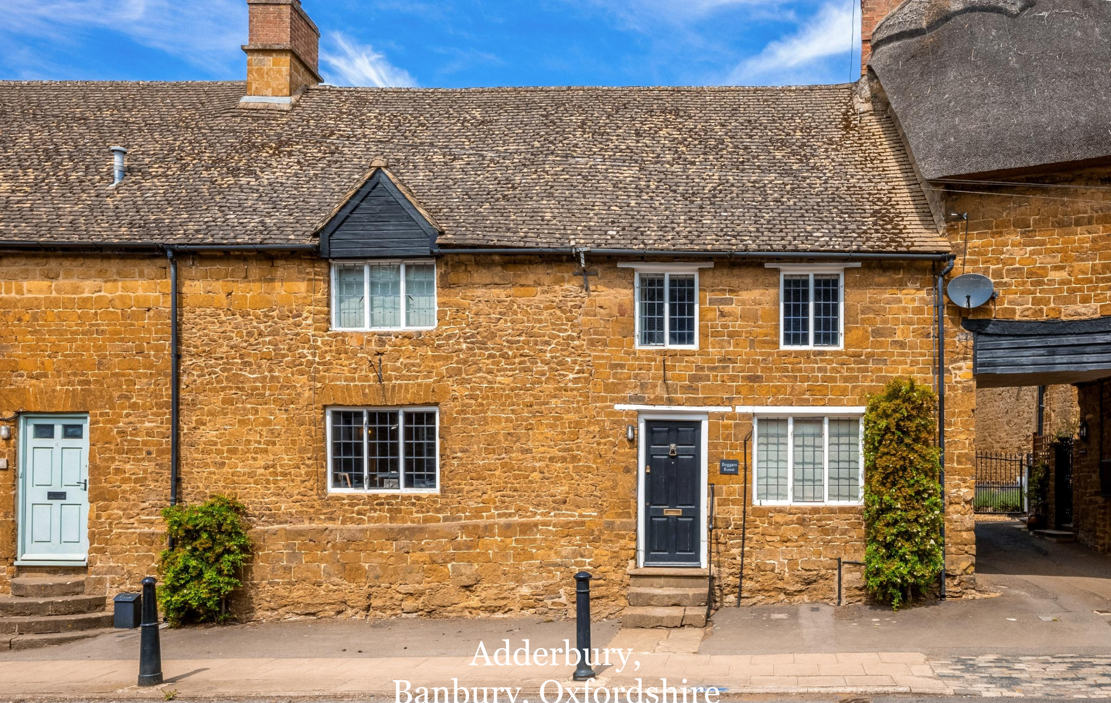
Adderbury, Banbury, Oxfordshire