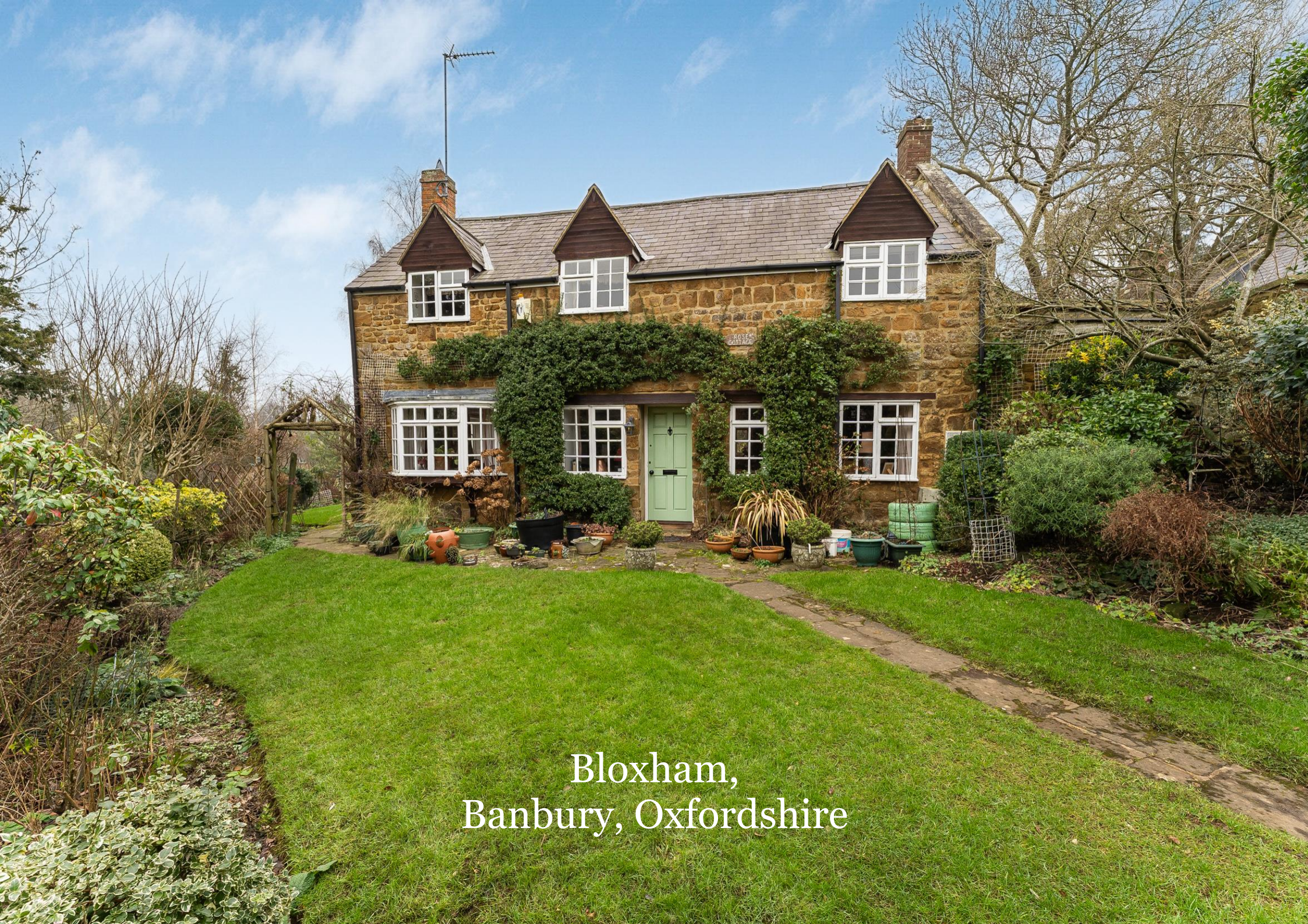
Bloxham, Banbury, Oxfordshire