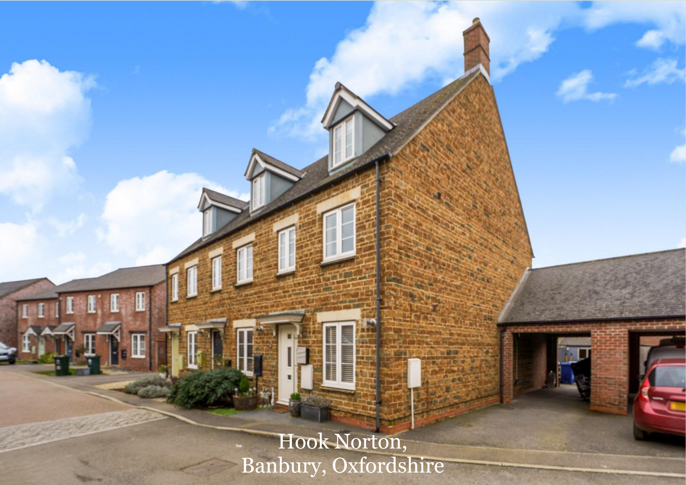
Hook Norton, Banbury, Oxfordshire