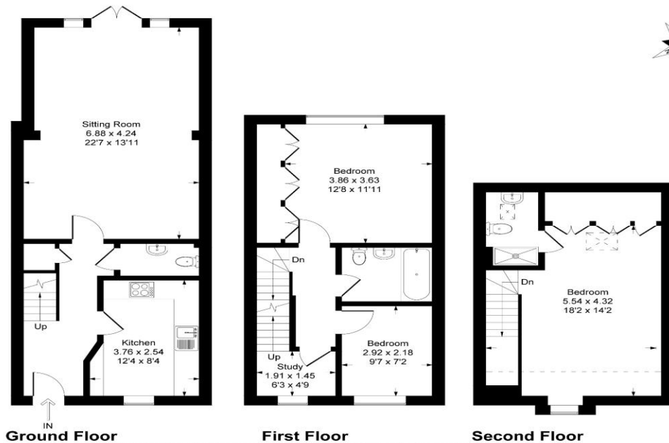
Illustration for identification purpose only, measurements approximate, and not to scale.

Approximate Gross Internal Area = 115.85 sq m / 1247 sq ft