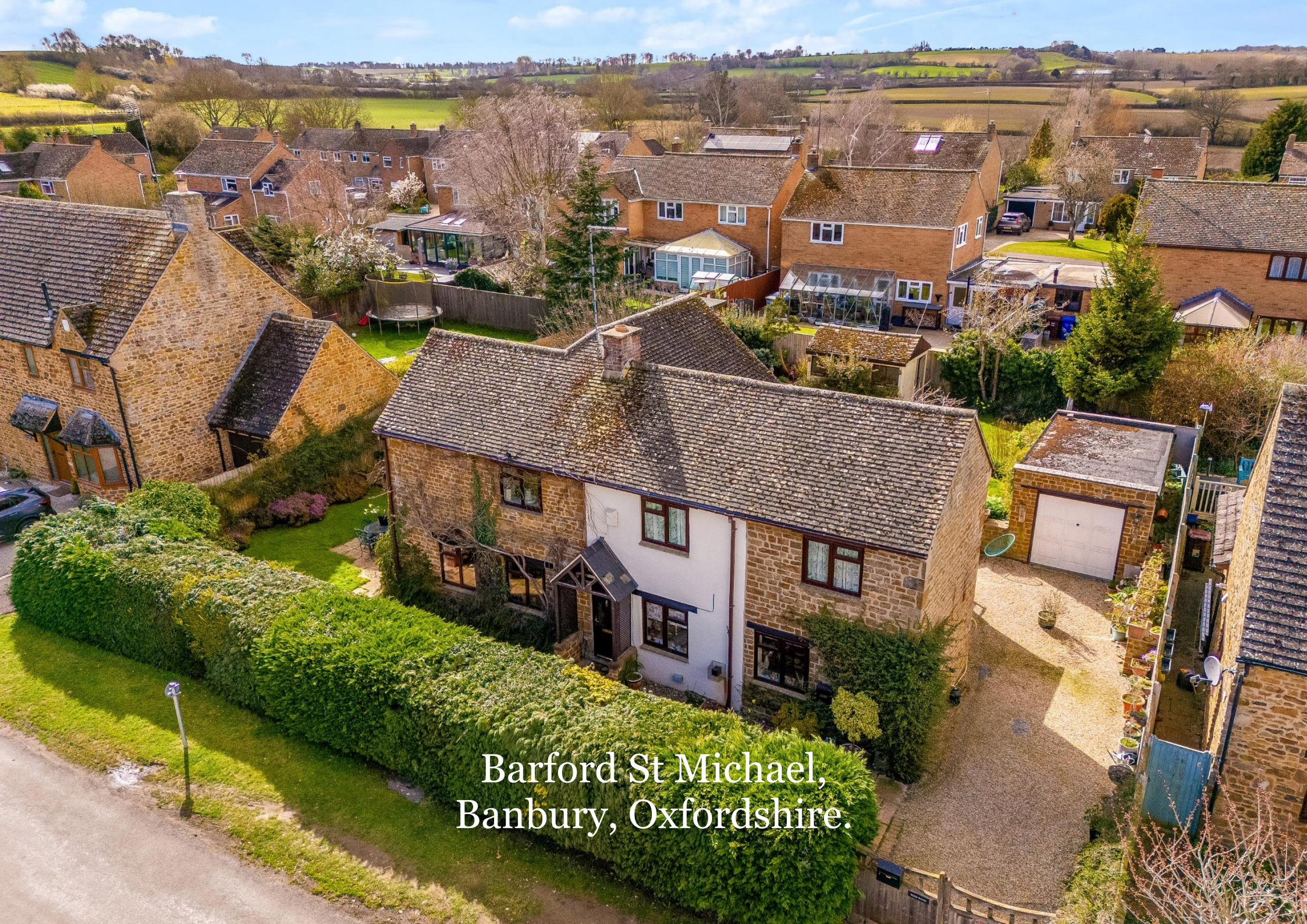
Barford St Michael, Banbury, Oxfordshire.