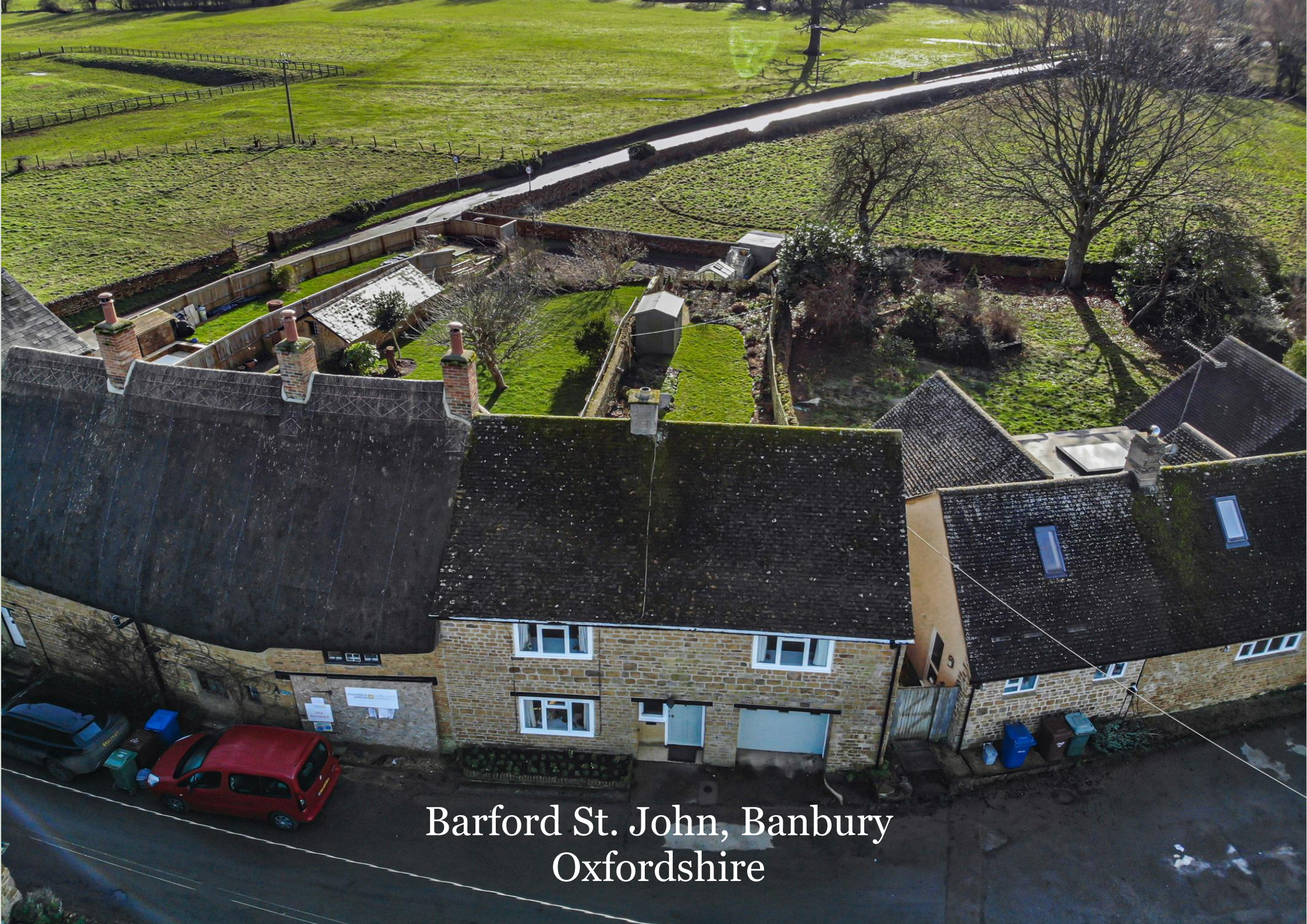
Barford St. John, Banbury Oxfordshire