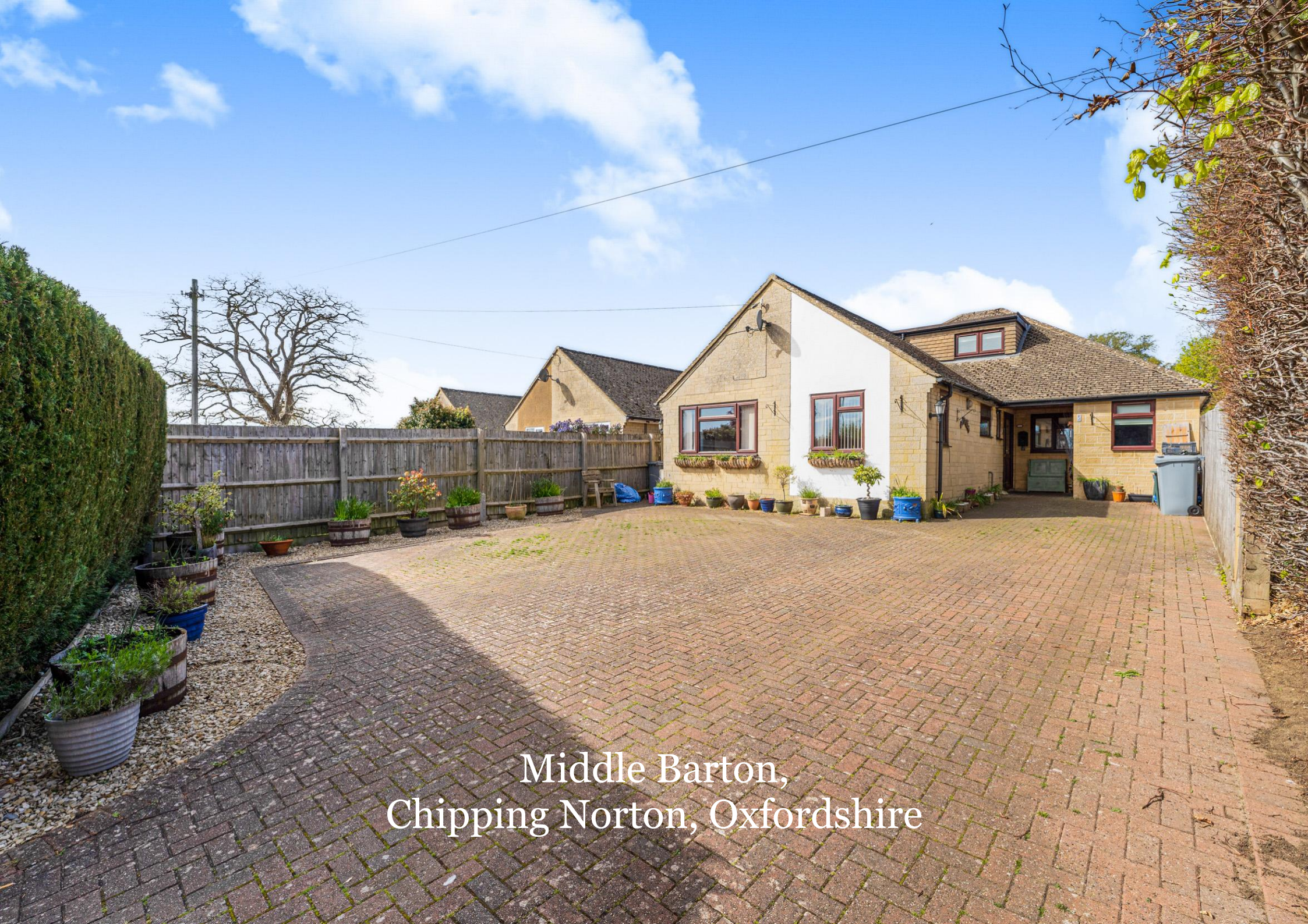
Middle Barton, Chipping Norton, Oxfordshire