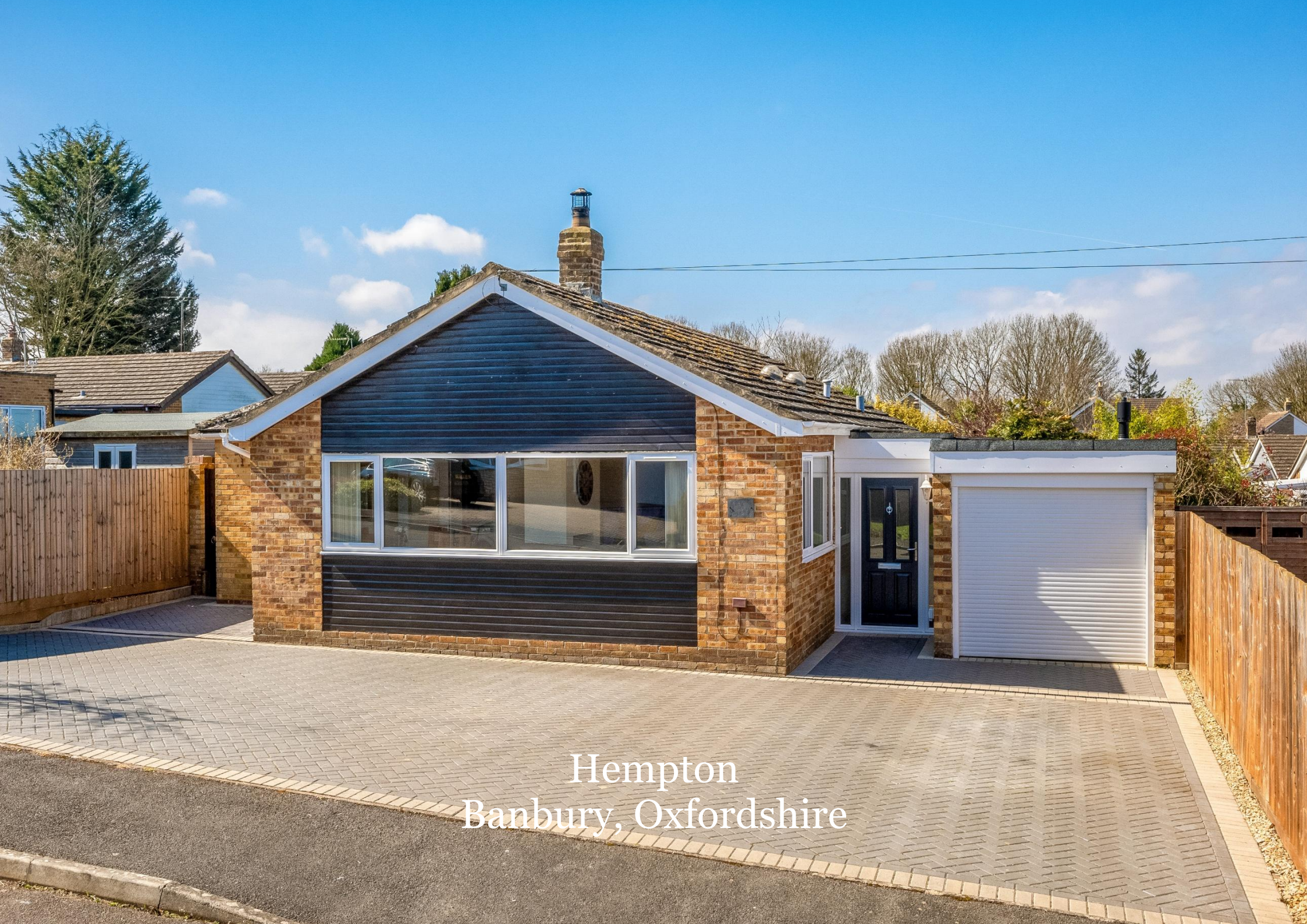
Hempton Banbury, Oxfordshire